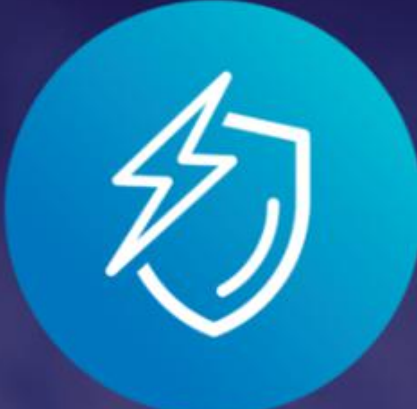
Lightning Protection Systems