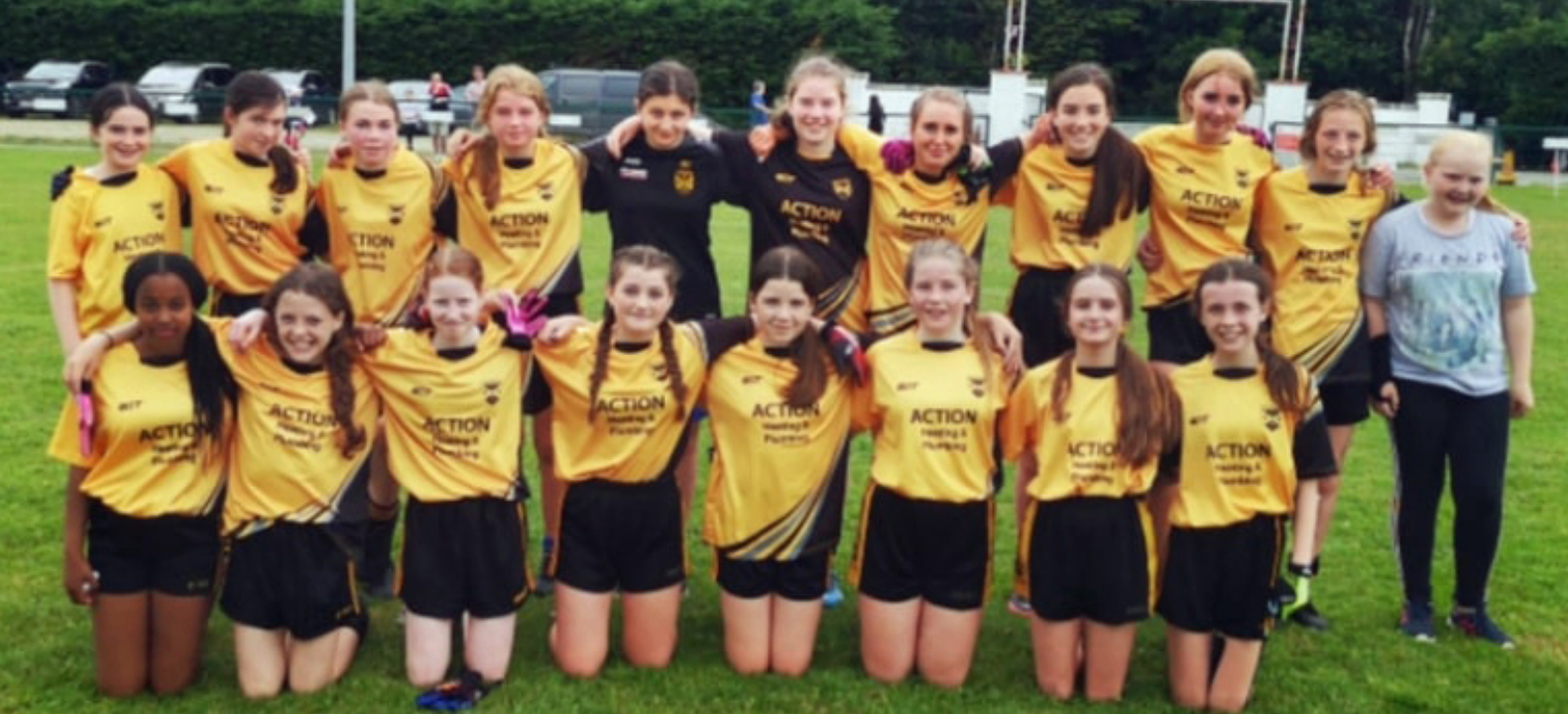
Under 14 Girls