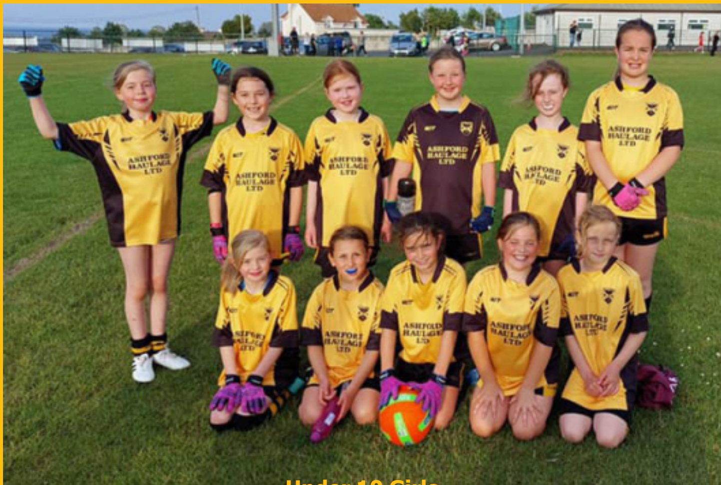
Under 10 Girls