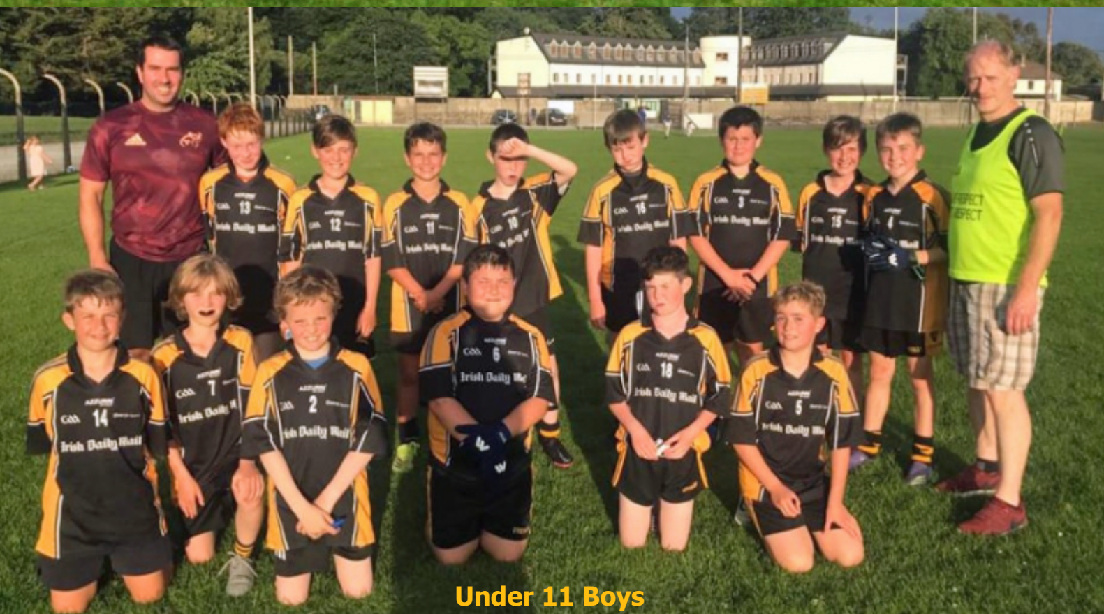
Under 11 Boys