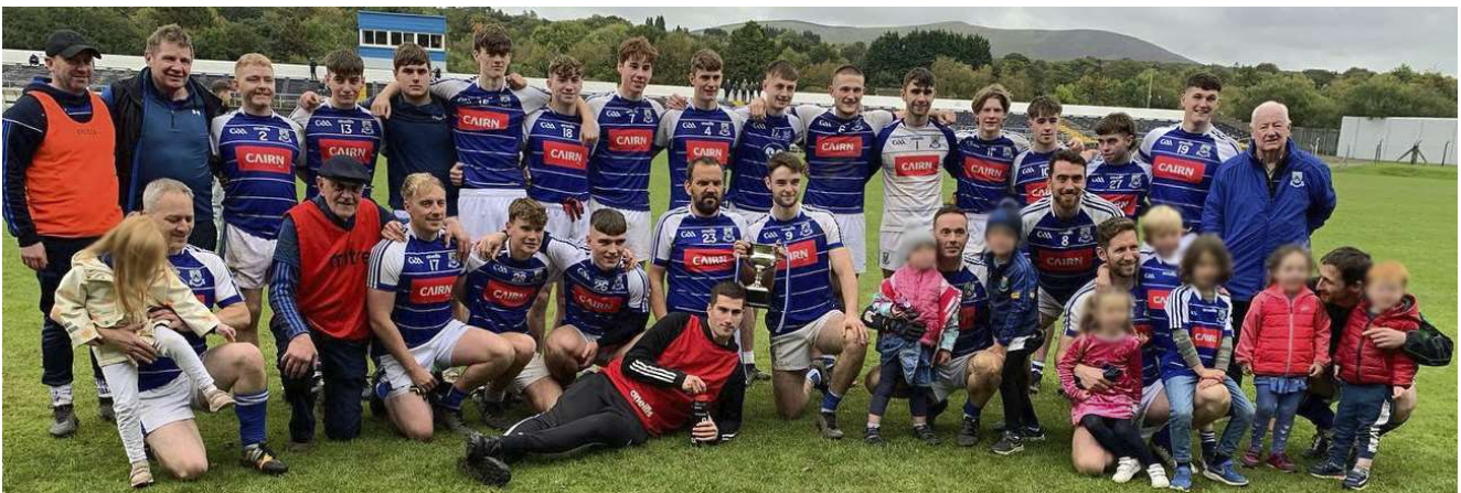
Junior D Football Champions 2022 Eire Og Greystones

Eire Óg Greystones 2-9 Vallemount 1-6. In the final Eire Og Greystones had a lot of scoring power up front and won on score line Eire Og Greystones 2-12 Tinahely 0-5.