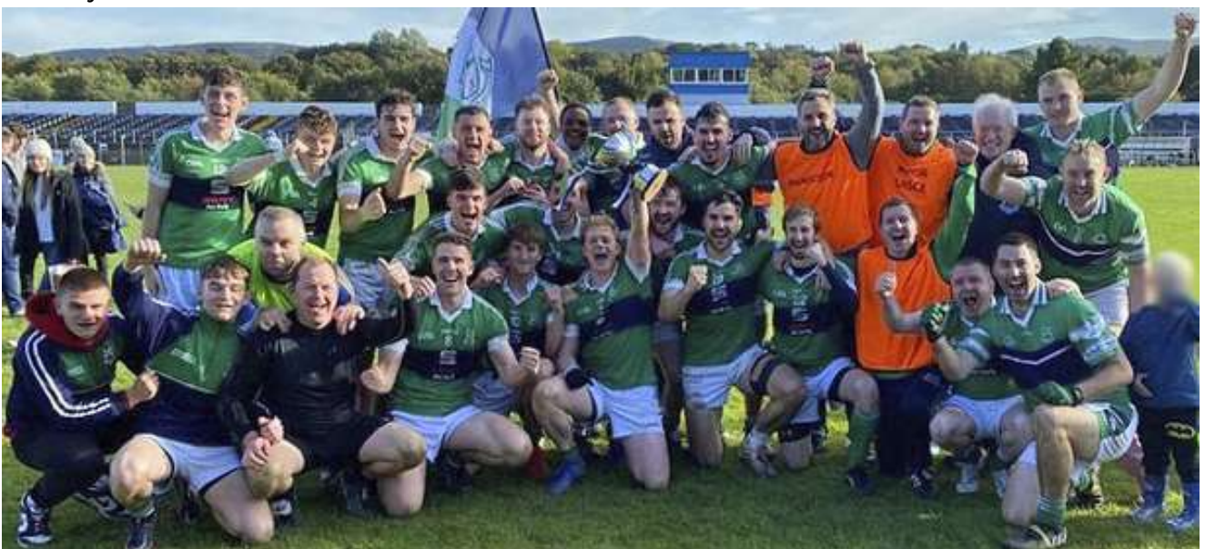
Junior B Football Champions 2022 Bray Emmets

Tinahely were too strong for Baltinglass and won 1-15 to 1-6, while the other semi-final was a lot closer Bray Emmets beating Eire Og Greystones 0-8 to 0-6. The final was very entertaining and nip and tuck to the end, Bray Emmets taking the title, Bray Emmets 2-12 Tinahely 3-8.