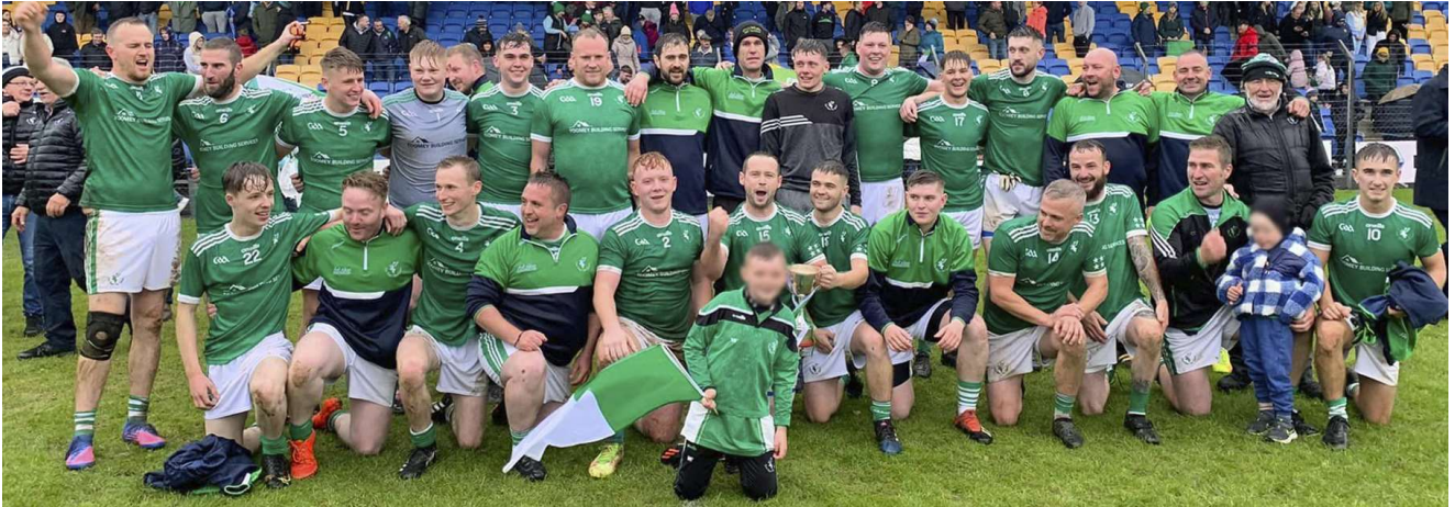
Junior C Football Champions 2022 Donard The Glen

and Donard The Glen 2-16 Annacura 1-13. The final was very close and it looked like Blessington were taking the cup but Donard The Glen were not giving up and in the last kick of the game they found a gap in the net to claim the title, Donard The Glen 1-8 Blessington 0-10.