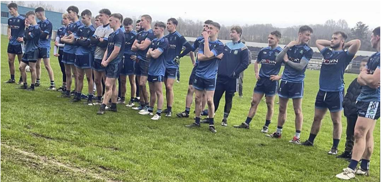
U19 Football A Champions 2022 An Tóchar

Michael Dywers 0-6 Michael Hogans 0-2, The final will see Rathnew and Michael Dwyers played on Sunday 11th Dec. In the C championship Pearse Gaels unfortunately had no team to play St Patrick's and Carnew beat Kilcoole 3-7 to 2-9. The final was played on Saturday 3rd Dec in Arklow well done to Carnew who took the title Carnew 1-8 St Patrick's 2-3. Well done to all the Clubs for their cooperation, I know some clubs would like to see this in better weather, but with adult games and clash with players it is difficult, maybe a discussion will take place for 2023.