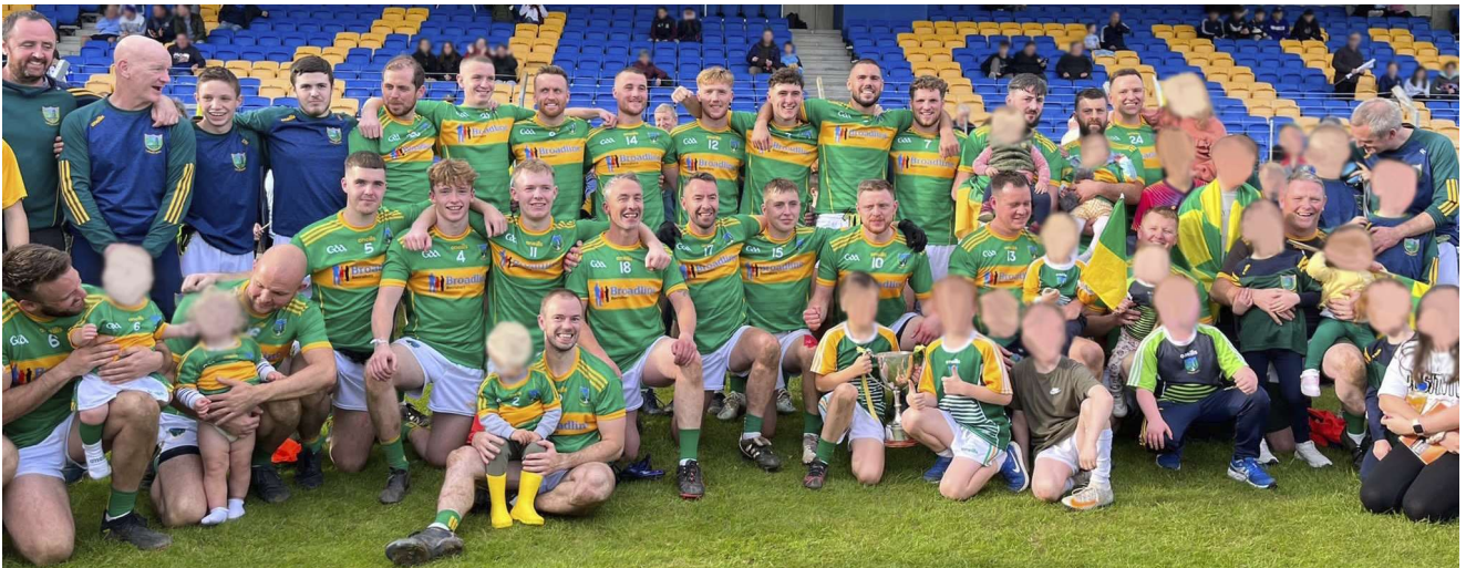
Junior A Football Champions 2022 Laragh

13 to 3-9. The final was exciting both teams working very hard, but Laragh were sharper and won 1-10 to 0-9. Laragh took on Amsterdam in their 1st round Leinster Club in Baltinglass winning 3-9 to 2-9 a great day for the Club. Sat 5th Nov was the Quarter final where they were home again in Echelon Park Aughrim, but unfortunately, they met a good side Castletown of Meath, and lost 2-19 to 0-7, Castletown went on to win the final last week.