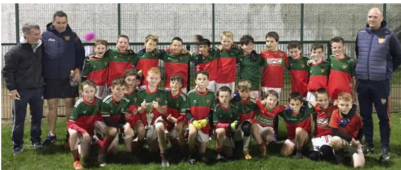
U11's Group 1