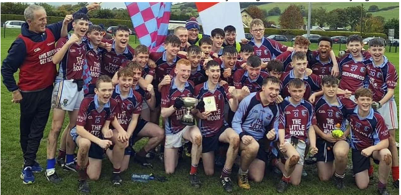
U15 Group 1

In terms of the league the Group 1 team after a couple of early and very close defeats began to really knit together and as a result they began to