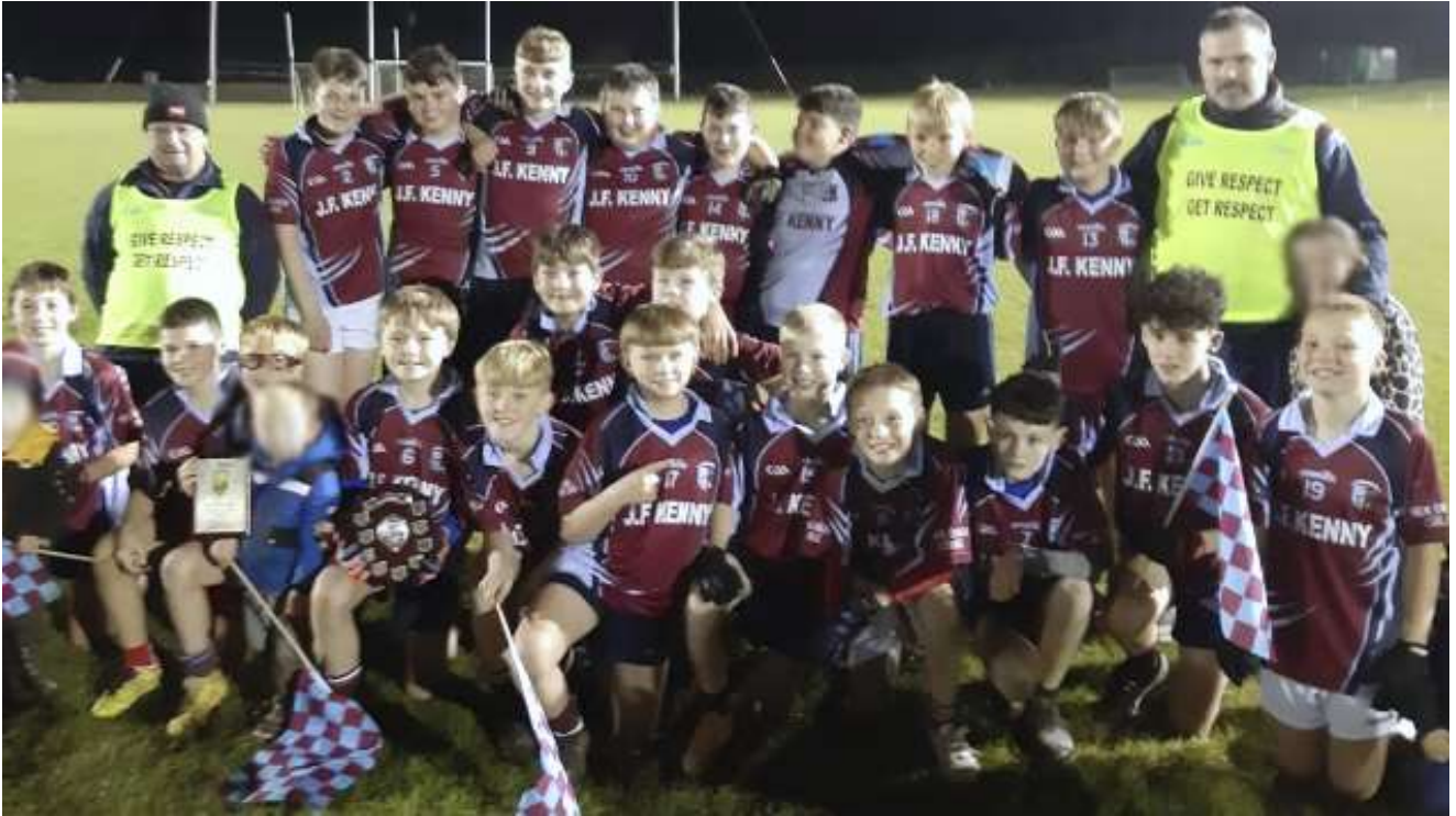
U13 division 4 team