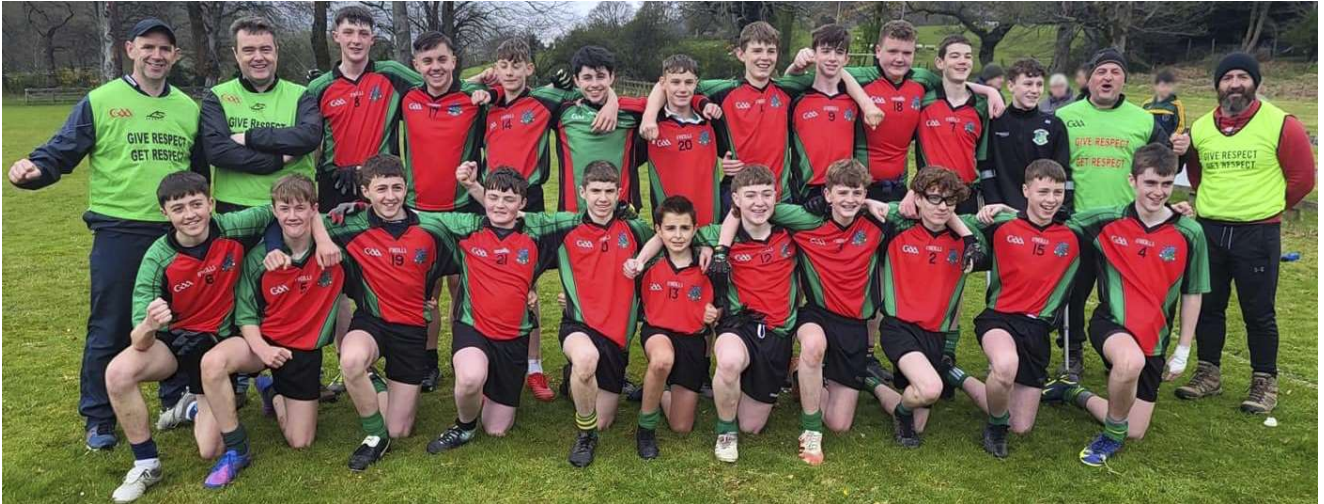
St. Kevin's U15 Feile