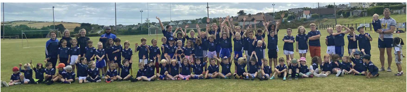
St Pats Cub Camp