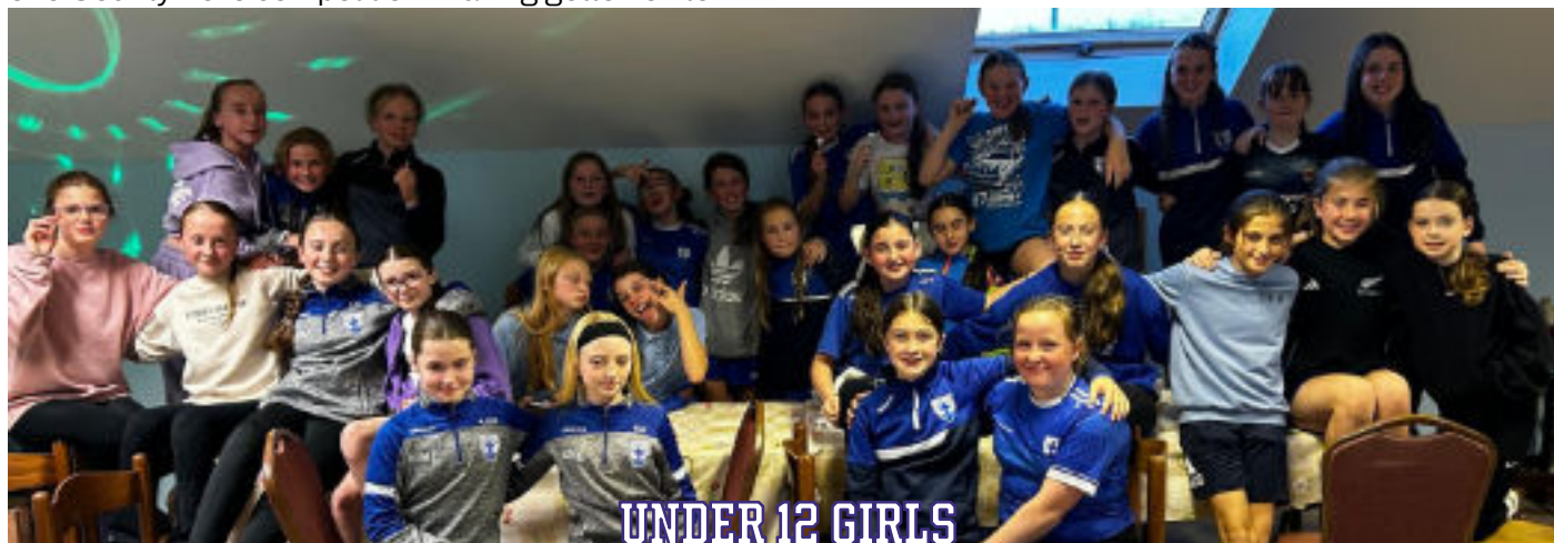
UNDER 12 GIRLS

We did some Yoga, some bonding and topped it off with a well-deserved bowling trip for all. Thanks to parents for all the support along the way. To the mentors/volunteers - without them there would be no football for these girls. Best of luck to those girls staying at U16 and those girls who move onto the next chapter.