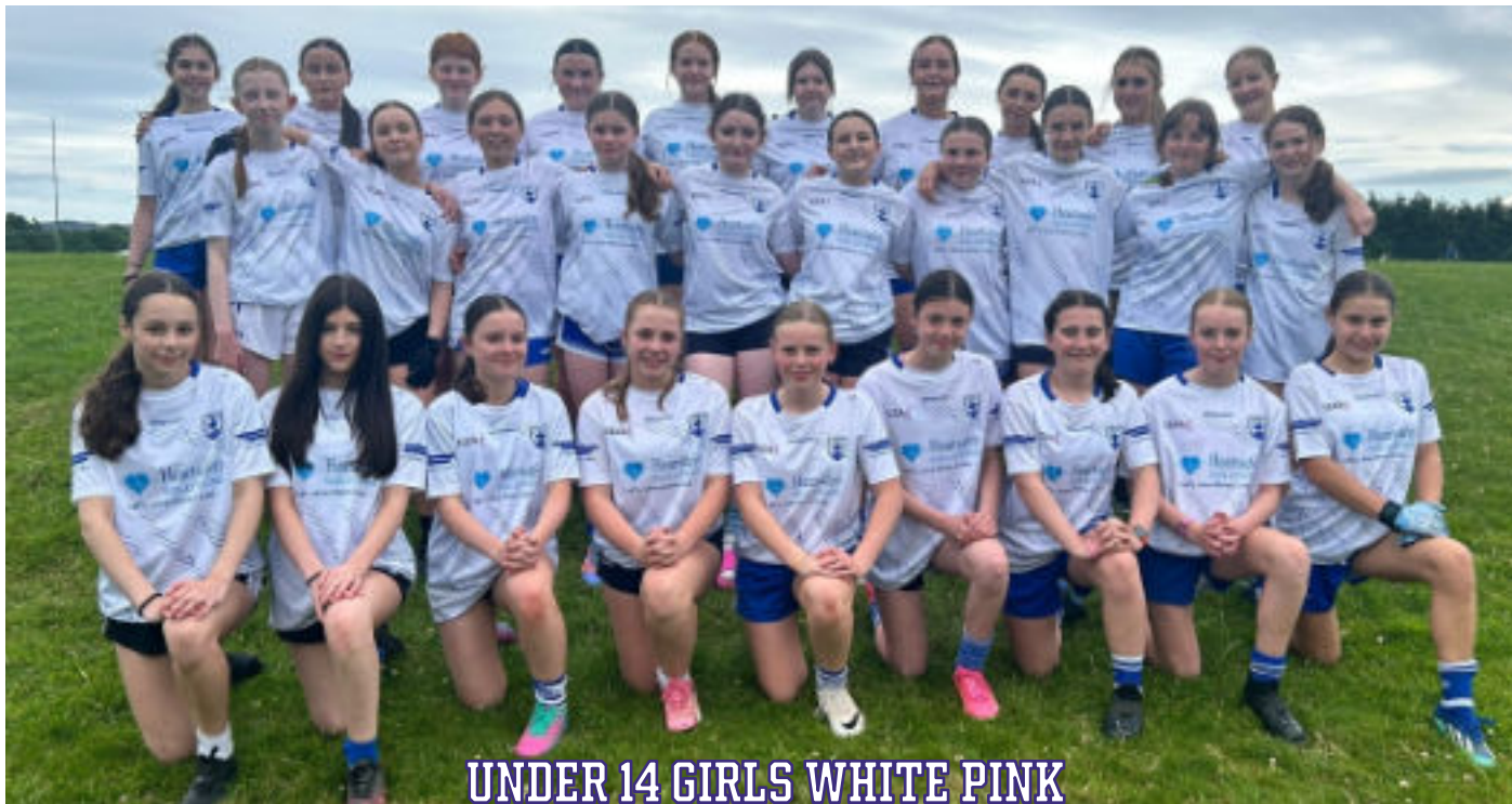
UNDER 14 GIRLS WHITE PINK