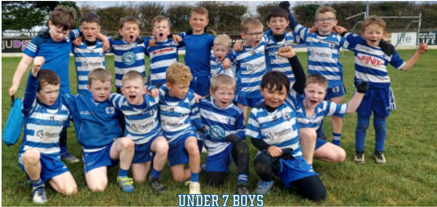
UNDER 7 BOYS