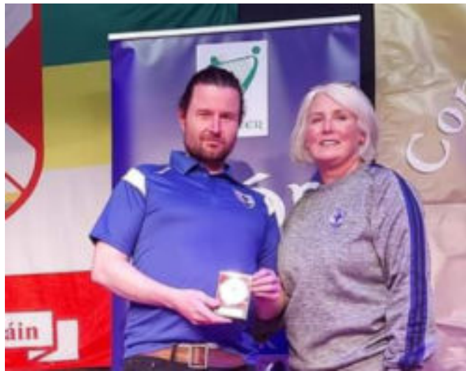
umha agus Airgid san am sin. Bhí muid ar an gcéad

Tá ceithre mhí dhéag caite ó chláraigh an club agus cuireadh tús le clár chun an Ghaeilge a úsáid níos mó laistigh den chlub agus bhuaigh sé bonn Cré-