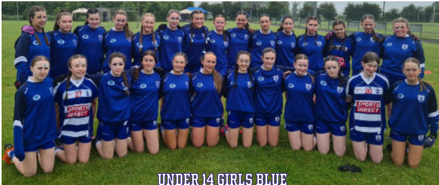
UNDER 14 GIRLS BLUE