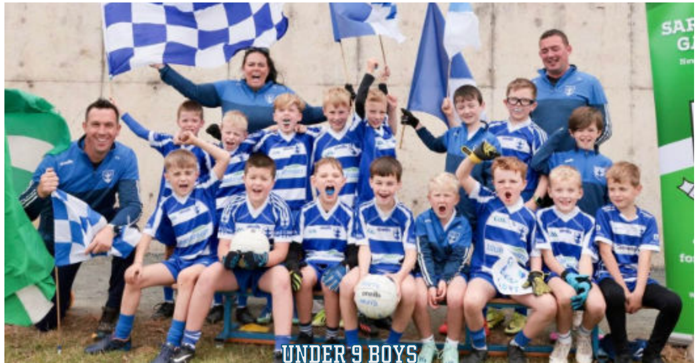
UNDER 9 BOYS

Kildare league we were very competitive & matched a lot of the top clubs in Kildare. We played in Sarsfields all Ireland blitz, this was unreal event & memories lads will remember for years, the huge standard didn't faze the lads at all. We have 23 players turning out for training throughout the year , matches 16 players playing , thanks to the U7s helping out for few games as well. Think the school blitz's or getting into the schools is huge, we gained a player as we finished up who played in the school blitz .Hopefully improvements keeping going in 2025