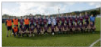
The Shillogh-Coolboy team who lost out to Aughrim in the Junior 'A' football championship final.