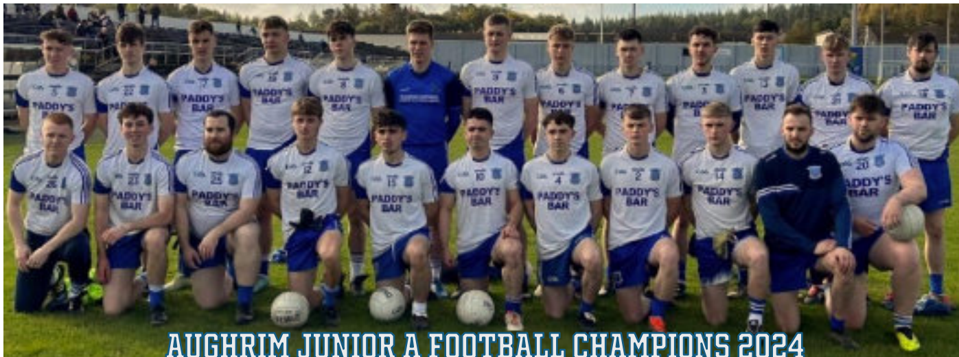
AUGHRIM JUNIOR A FOOTBALL CHAMPIONS 2024

The dream of being re-instated to intermediate motivated them through the very tight group stages and a quarter final victory vs the mighty An Tochar followed by a win in the semi-final against the odds yet again vs Kilmacanogue.