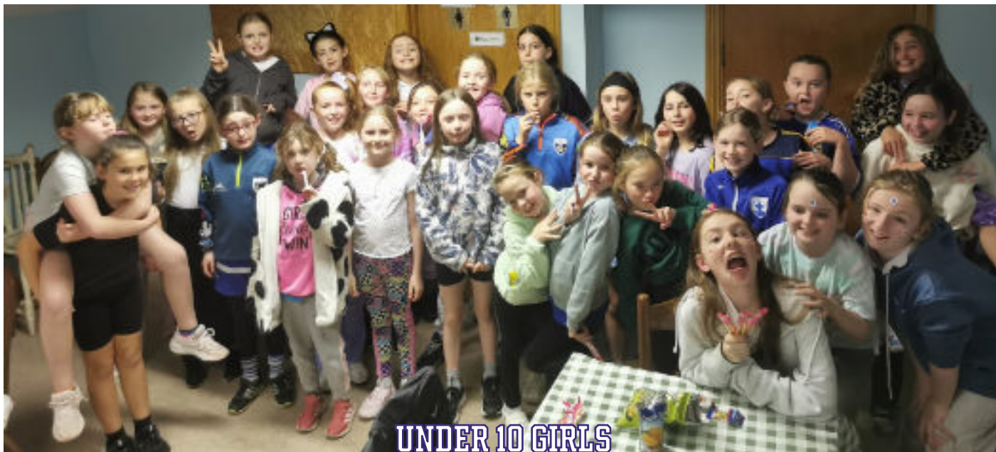
UNDER 10 GIRLS

Blitz, and once again the girls showed how much they have improved.