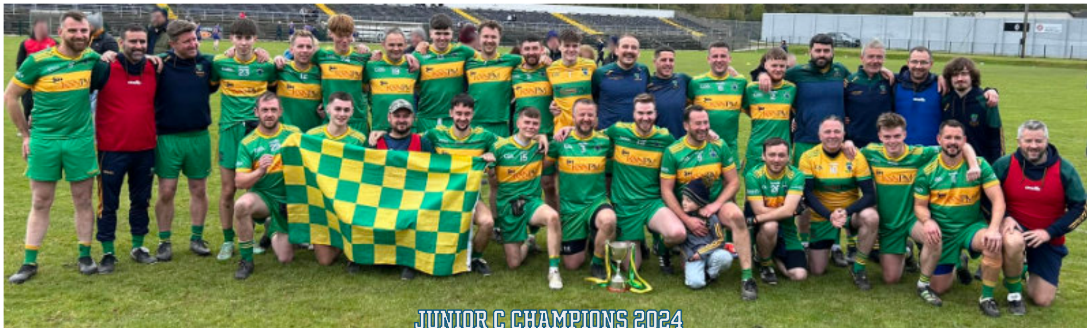
JUNIOR C CHAMPIONS 2024

The final had arrived, the flags were up, the team was ready to take to the field in Aughrim to face last year's finalist Carnew. This was a very entertaining game with everyone giving their absolute all for the team, in the