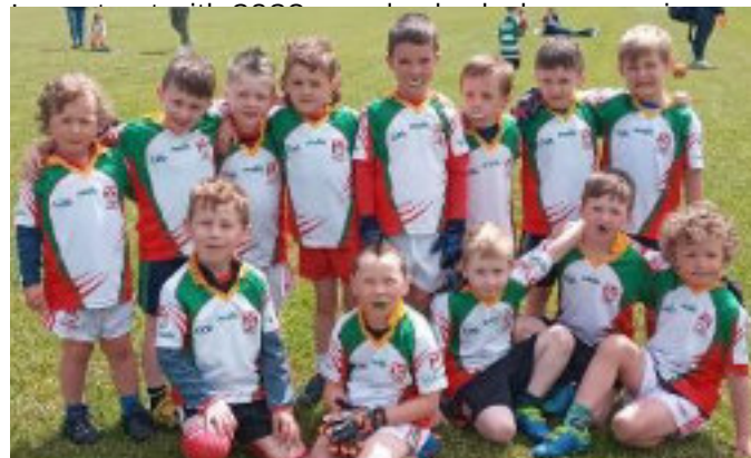
U7 FOOTBALL GO GAMES IN BALLYMANUS

We had a busy year with the U7s, with good numbers showing up on a regular basis for training each Thursday evening. Training focused on movement and drills emphasising the basic skills of the game, working as a collective, having fun, etc.