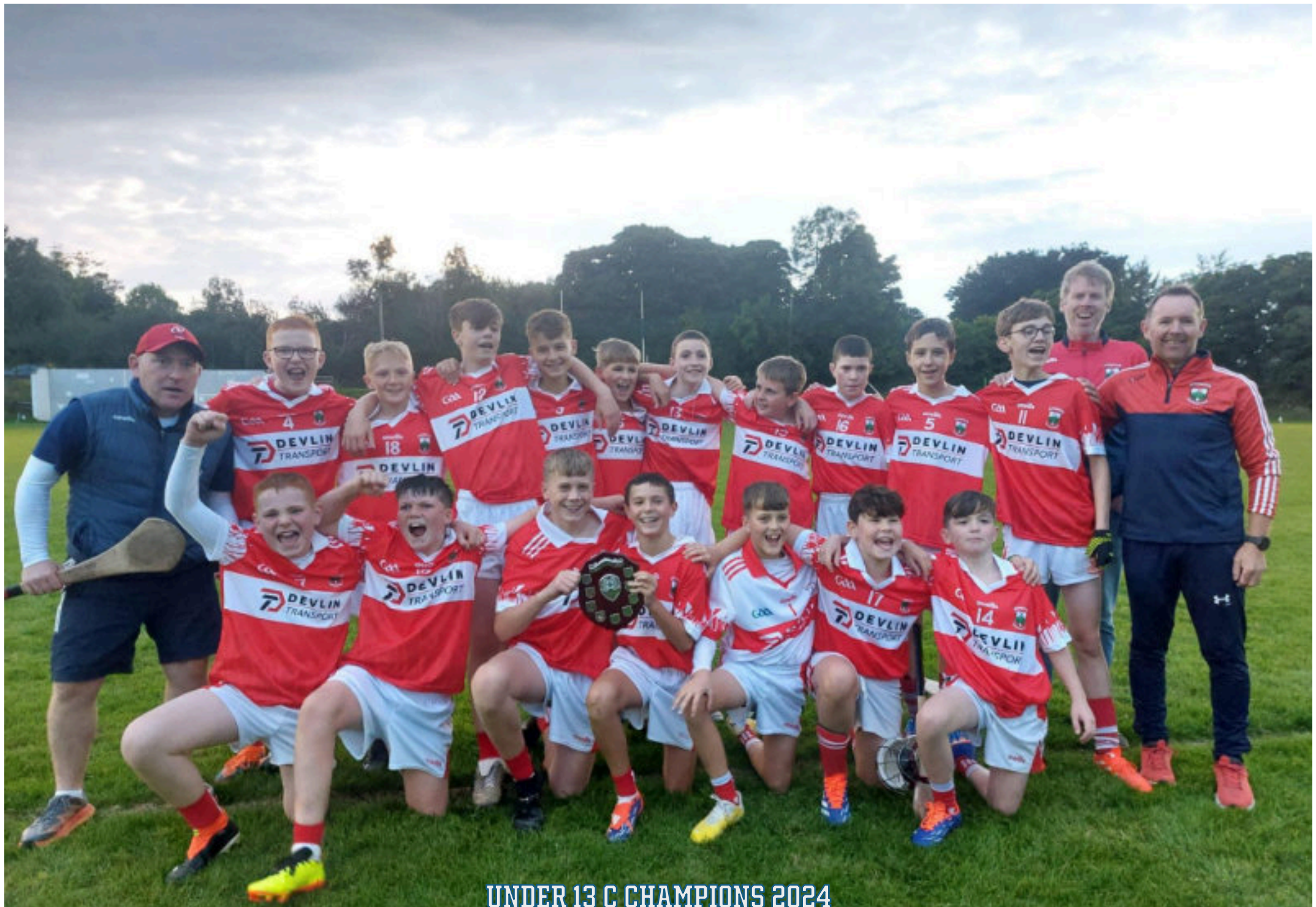
UNDER 13 C CHAMPIONS 2024