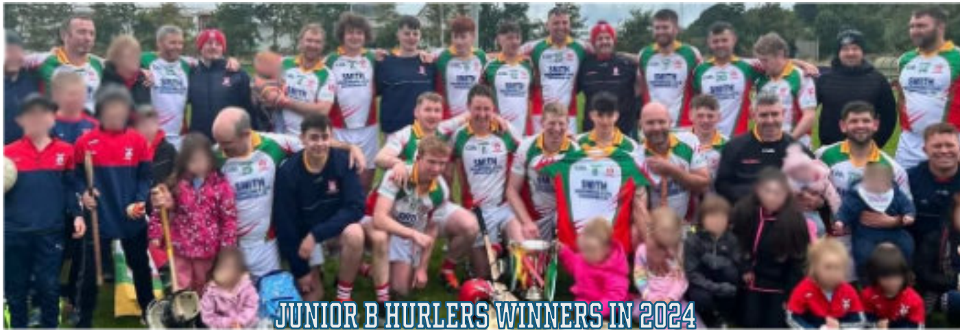
JUNIOR B HURLERS WINNERS IN 2024