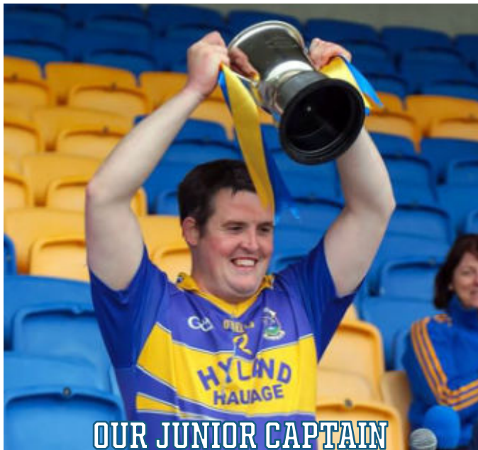
OUR JUNIOR CAPTAIN

Hurling Championship. We faced each game as if it was a final. We had a big panel of players to help us for each game. We were delighted when we ended the league group campaign unbeaten. We then had to face Eire Óg Greystones in the League Final. We were delighted that we overcame the massive challenge that Eire Óg brought to us on a sunny Wednesday evening in Echelon Park Aughrim. We had a great crowd to cheer on our players in the final.