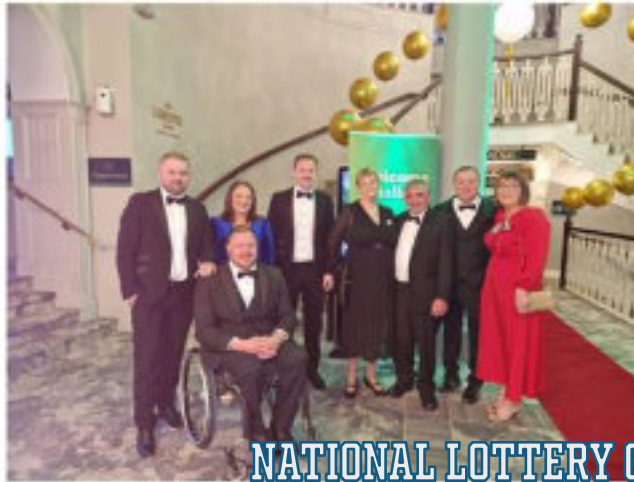
NATIONAL LOTTERY GOOD CAUSE AWARDS NIGHT

All roads then led to Killashee Hotel in Naas on the 12th of October to the Good Cause Awards black-tie event and whilst we didn't take away a National Award, being there in itself was winning. It was just such an inspirational and humbling experience to