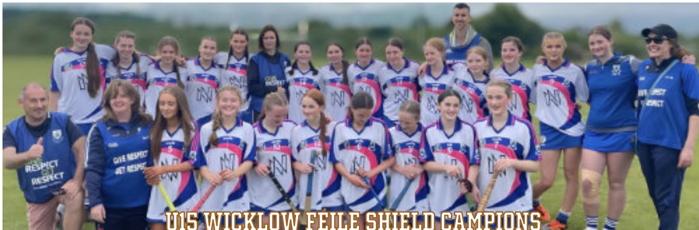
U15 WICKLOW FEILE SHIELD CHAMPIONS

The U16s had a remarkable journey filled with challenges that were met with resilience and determination. Despite facing injuries, remained competitive in the league and showcased strength as a team. A standout moment was the U15 girls bringing home silverware from Féile for the first time in the club's history—a truly historic achievement! Another exciting milestone for the club was winning the U16 shield final. It's clear that hard work and teamwork are paving the way for a bright future.