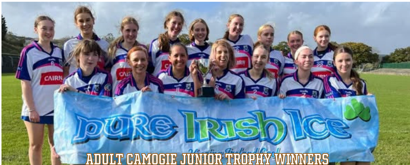
ADULT CAMOGIE JUNIOR TROPHY WINNERS