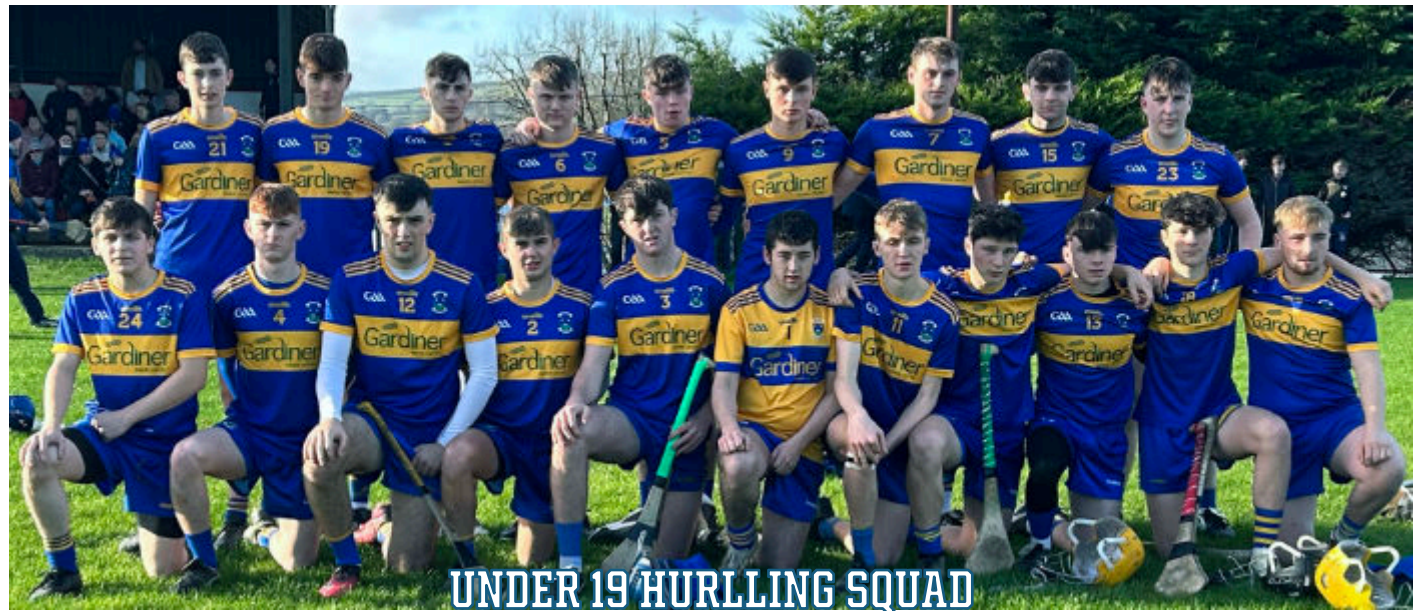
UNDER 19 HURLING SQUAD

As we had secured our place in the Junior A Hurling Championship, a few nerves started to creep in to the panel as we were losing some players to the Intermediate Hurling Team. We were fortunate that we had a big panel as this was not an issue. We were in the A group with Arklow Rock Parnell's, Eire Óg Greystones and St. Patrick's Wicklow Town. We began our Championship campaign with a home fixture against Eire Óg Greystones. As we had lost some key players from the league campaign, we were unsure how our team would fare against a strong Eire Óg Greystones team. The result showed that we should have no worry as our players scored a massive 4-11 to ensure we were victorious. We then headed to Wicklow Town to face St. Patrick's. This game was a great tussle between both teams but unfortunately had to be abandoned due to an injury to our player. A week later, we returned to Wicklow