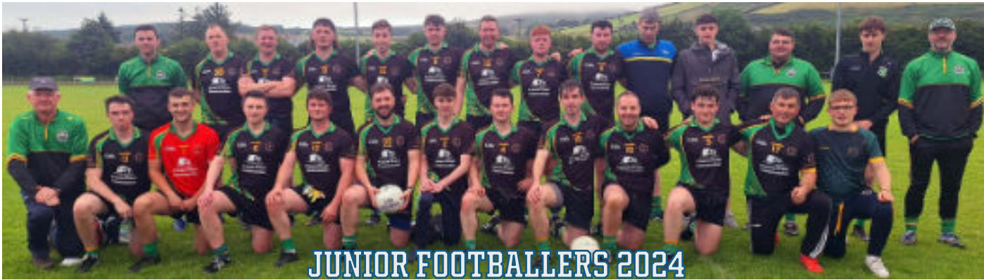
JUNIOR FOOTBALLERS 2024