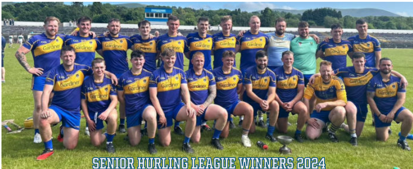
SENIOR HURLING LEAGUE WINNERS 2024