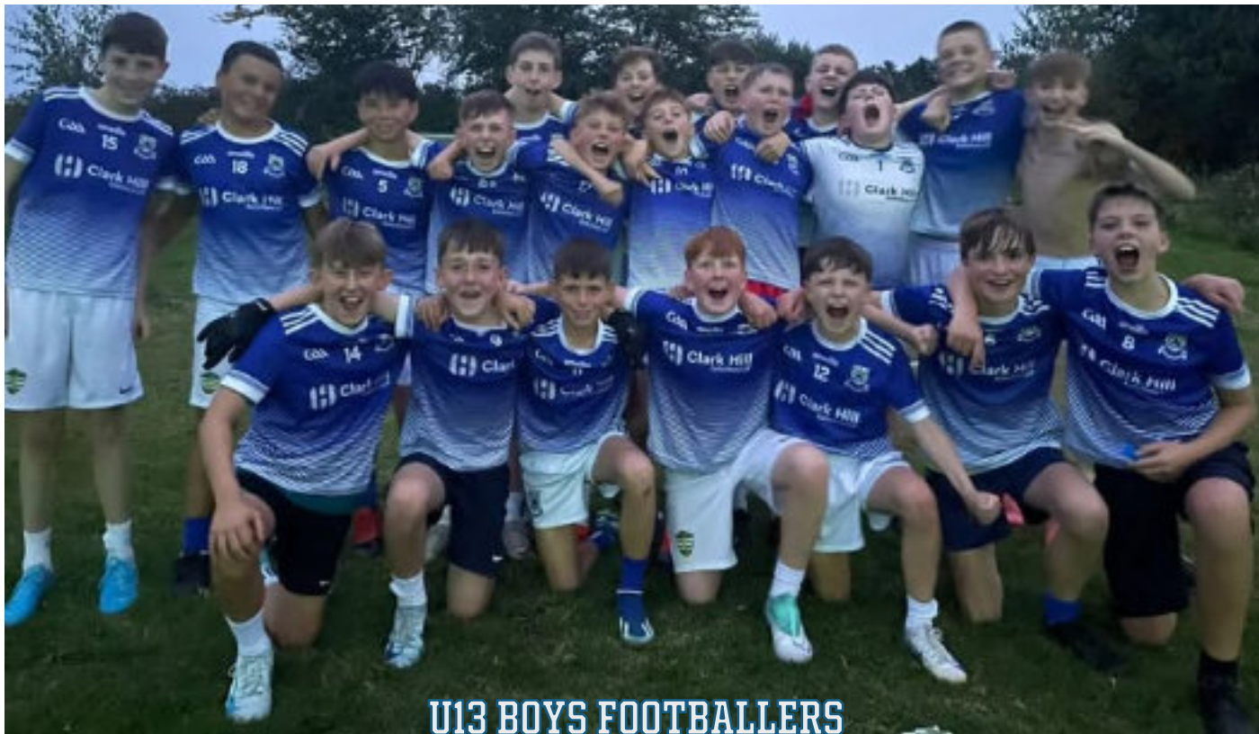
U13 BOYS FOOTBALLERS

against Carnew and despite losing them narrowly, the development value to the younger players in getting to the latter stages will pay dividends to the club long into the future. Our Seniors had a year to remember, playing 28 matches in total. We were finally accepted into the Dublin hurling league. It gave us real impetus for the year and we were in contention for promotion right up to the last day.