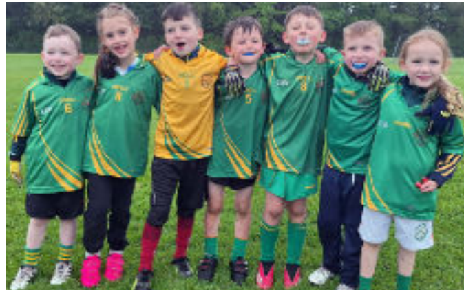
HOLLYWOOD GO GAMES TEAM 2024

Our nursery and Go Games groups continue to go from strength to strength with numbers attending continuing to increase. Our thanks to all our volunteers who work tirelessly with this group and to Wicklow GAA for arranging games and blitzes for this age group. Our juvenile players particularly enjoyed the games played under lights towards the end of the season.