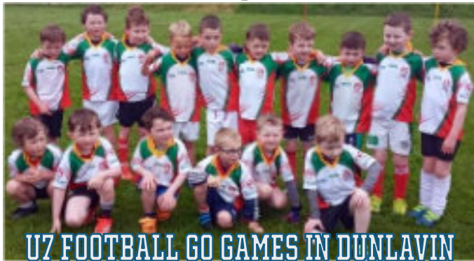
U7 FOOTBALL GO GAMES IN DUNLAVIN

Our journey in the Senior Football Championship also ended in huge disappointment for us, losing out by a point in the semi-final to our neighbours Baltinglass. This was the 13th week on the bounce for a large number of the players and it finally took its toll, we had gone to the well one too many times. The team picked up some good results during the year gaining promotion to Division 1 for 2025 and losing by the narrowest of margins in the league final to Baltinglass. There was some further good work during the group stages of championship also, getting a draw out of the game vs St Pats when a defeat was imminent. A huge second half