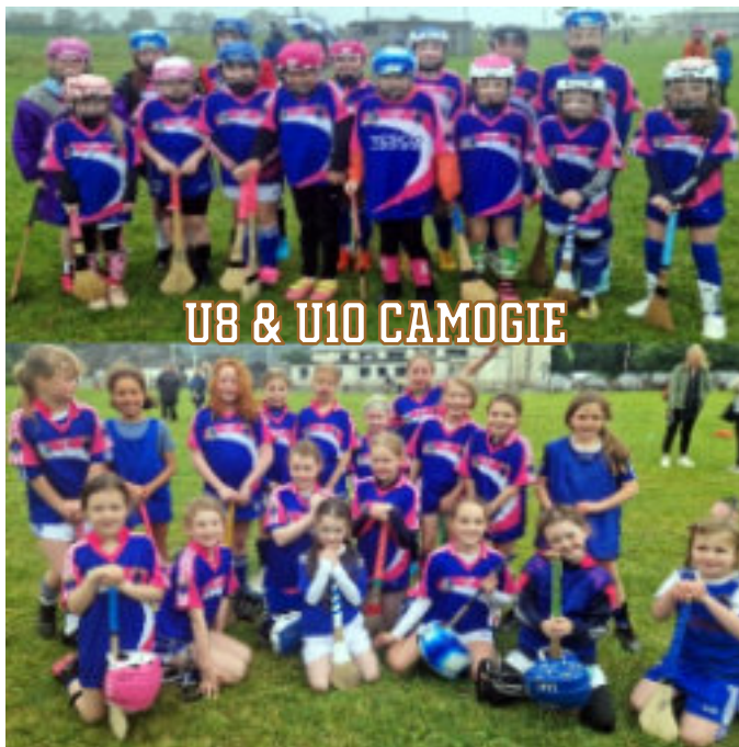
U8 & U10 CAMOGIE