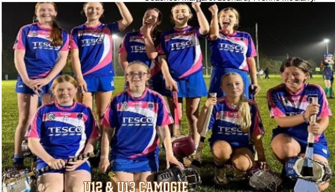
U12 & U13 CAMOGIE