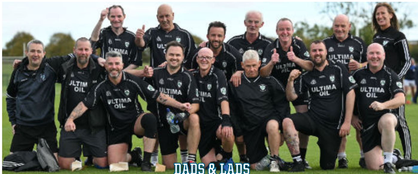
DADS & LADS