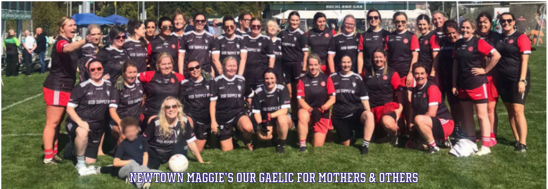
NEWTOWN MAGGIE'S OUR GAELIC FOR MOTHERS & OTHERS