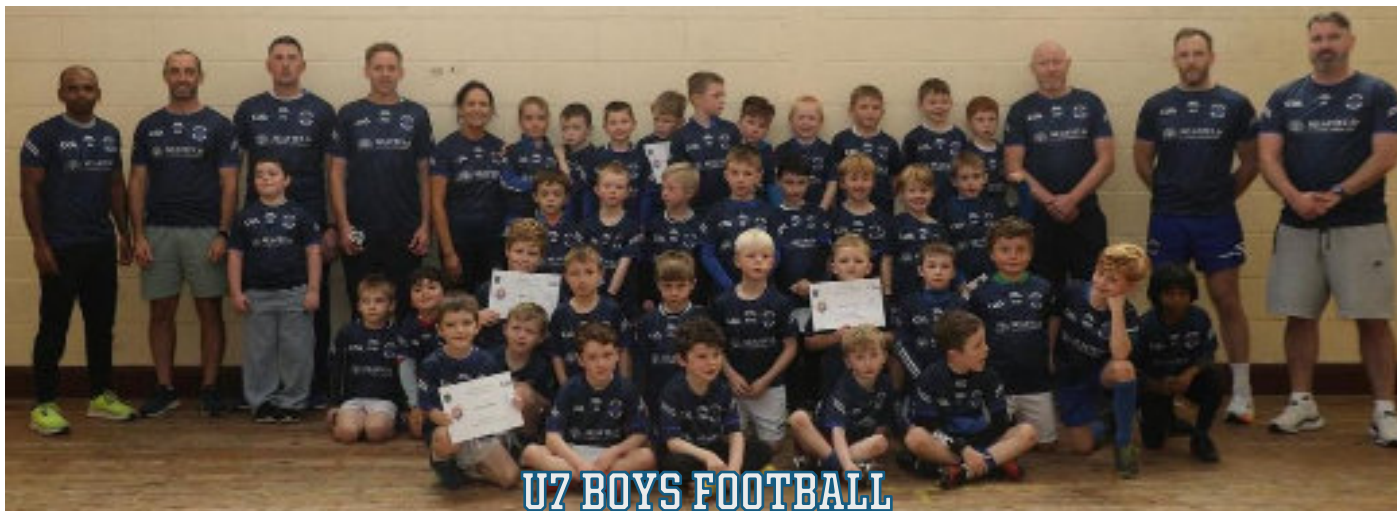
U7 BOYS FOOTBALL