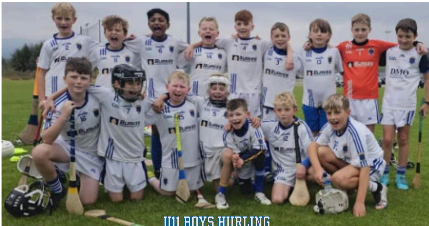
U11 BOYS HURLING