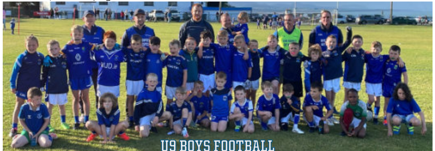
U9 BOYS FOOTBALL

It was a good year for the U9 footballers. Training started in March with 50+ boys involved. One or two training sessions were held each week (usually 30-40 attended) with clear progress and increased