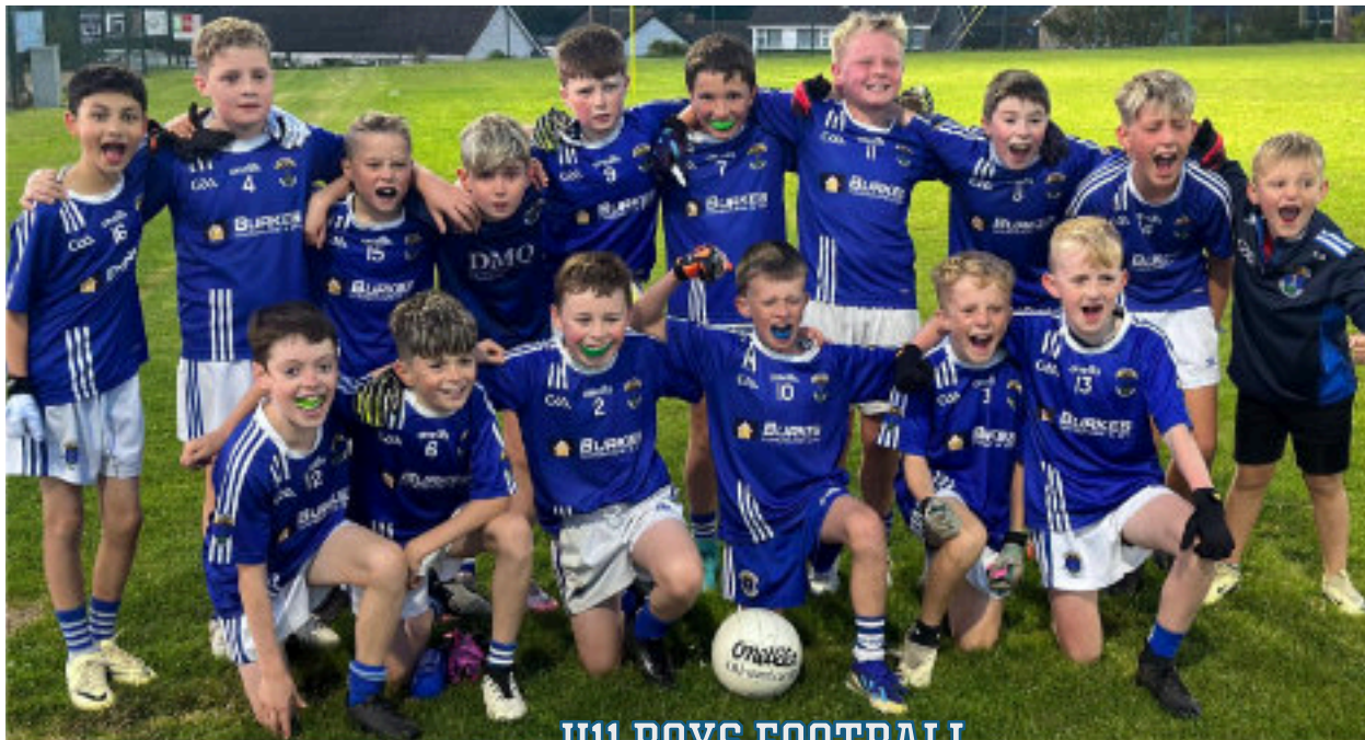
U11 BOYS FOOTBALL