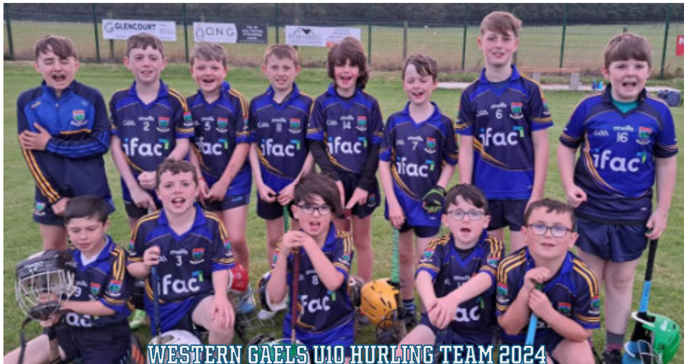
WESTERN GAELS U10 HURLING TEAM 2024