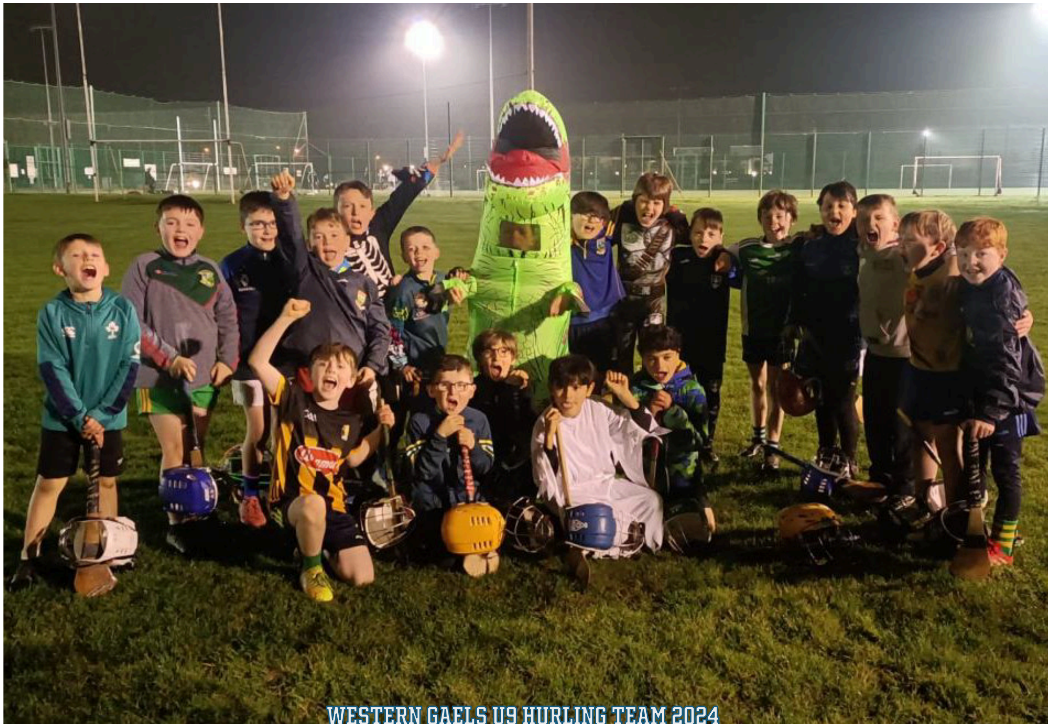
WESTERN GAELS U9 HURLING TEAM 2024