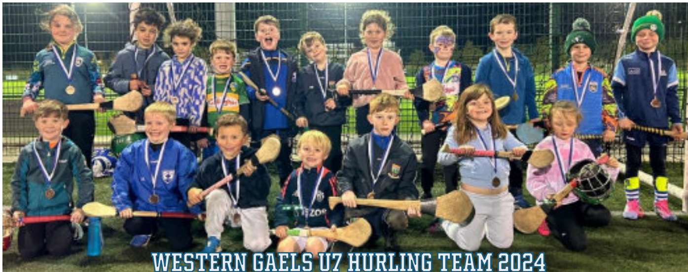
WESTERN GAELS U7 HURLING TEAM 2024