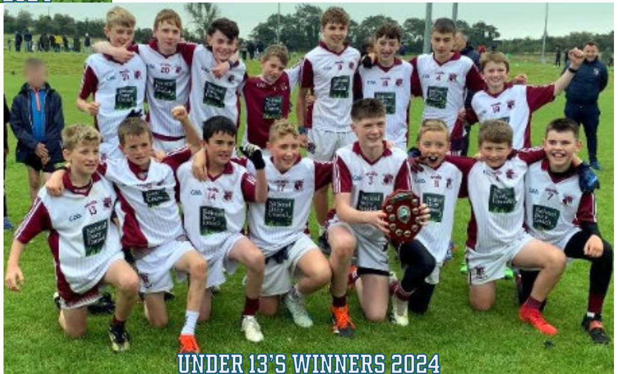
UNDER 13'S WINNERS 2024