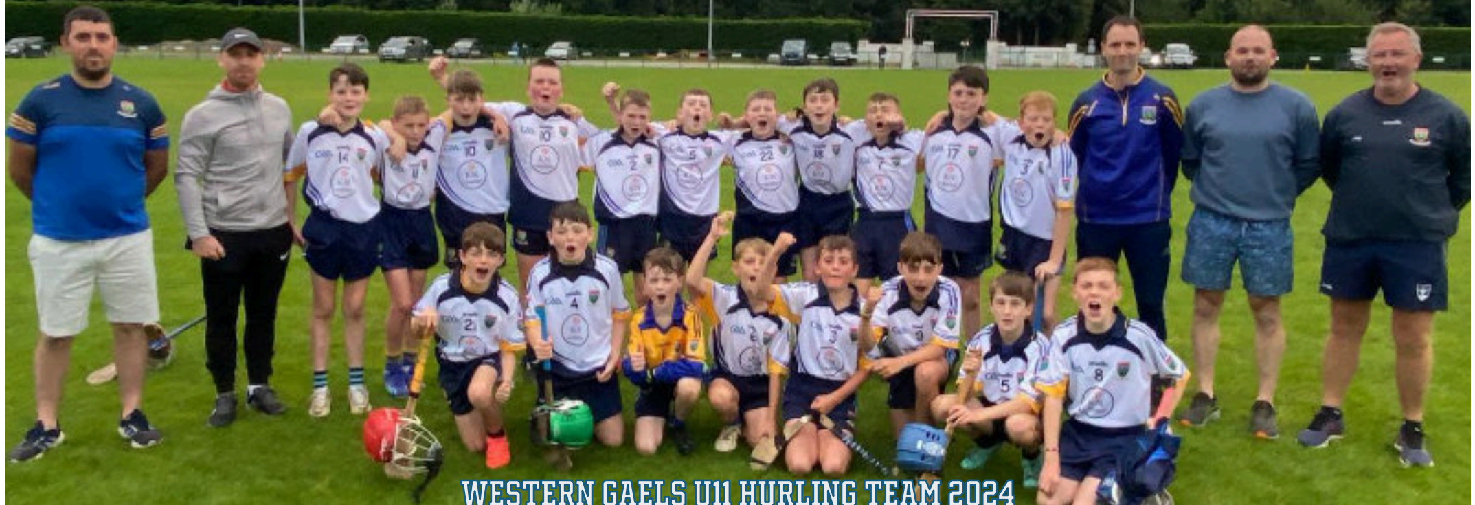
WESTERN GAELS U11 HURLING TEAM 2024