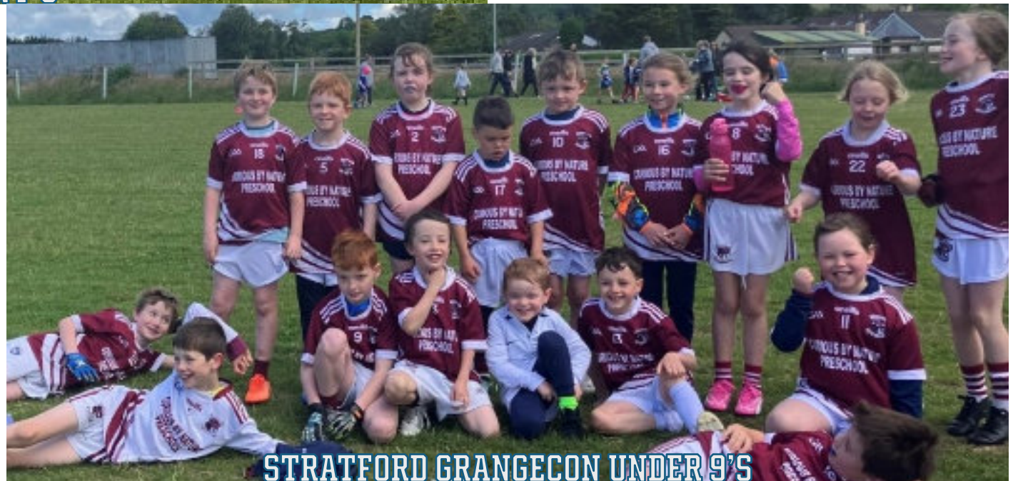
STRATFORD GRANGECON UNDER 9'S

Our academy players (4-6 years old) trained each Saturday morning and enjoyed a great introduction to football.