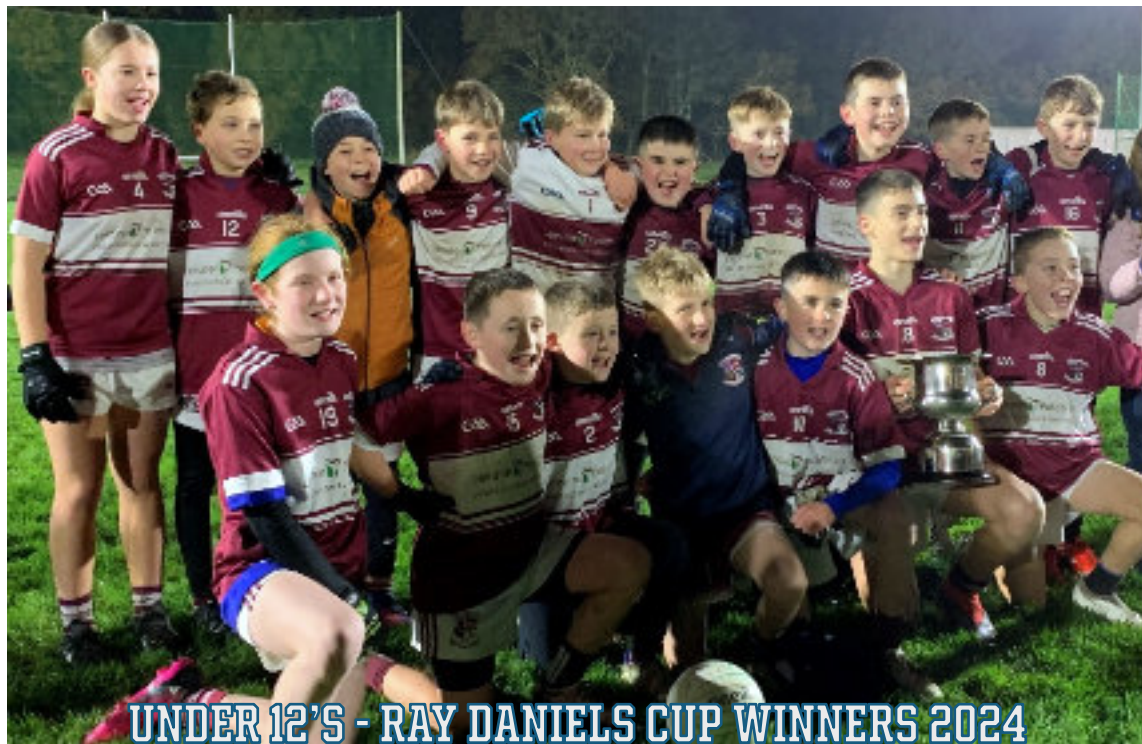
UNDER 12'S - RAY DANIELS CUP WINNERS 2024