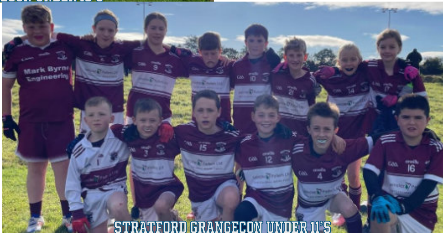
STRATFORD GRANGECON UNDER 11'S

This was never more evident that in our in the final against Kilcoole. Coming back from a thirteen-point deficit at half time to win a tension filled final, showed the belief and skills that this team has developed throughout the year.