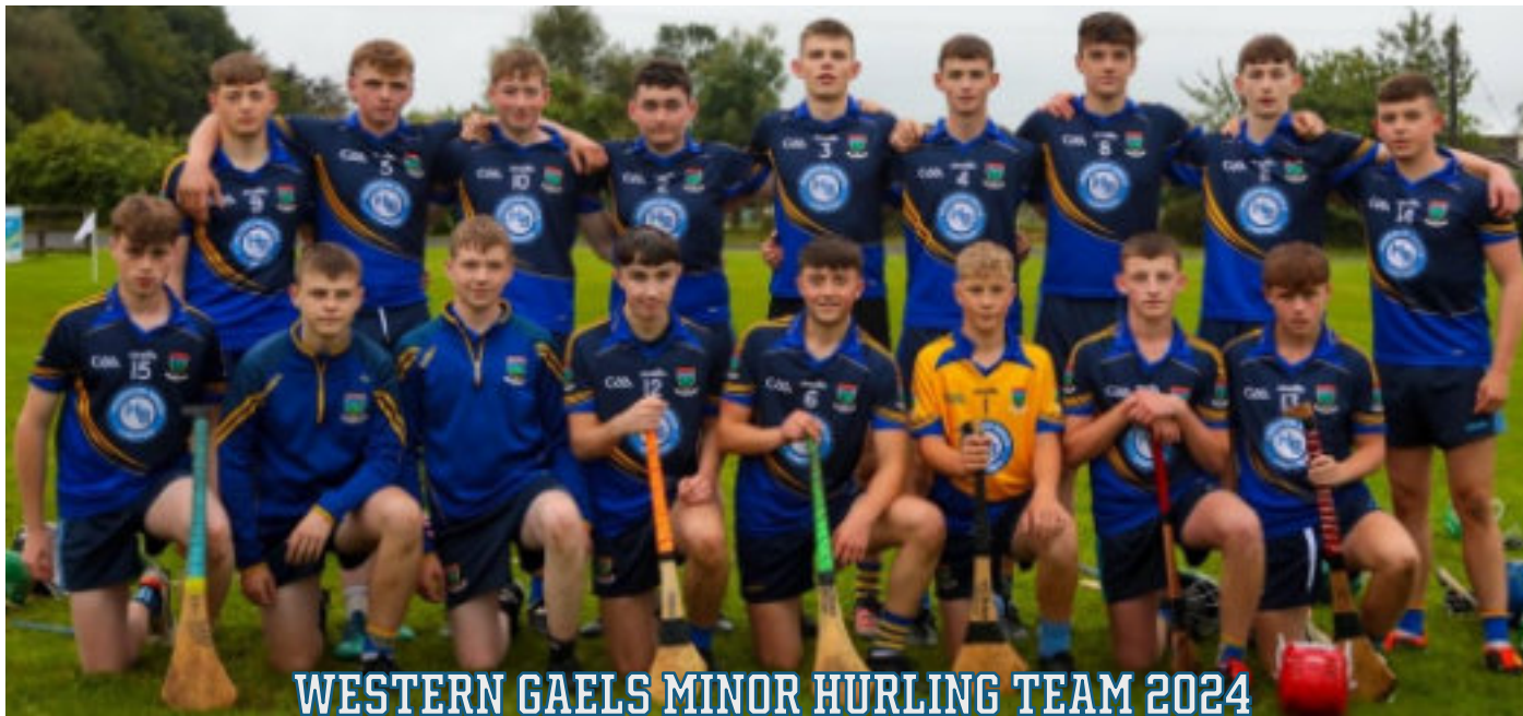
WESTERN GAELS MINOR HURLING TEAM 2024