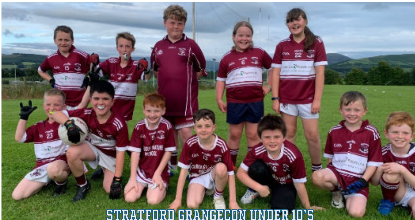
STRATFORD GRANGECON UNDER 10'S

This is a competition which Stratford/Grangecon have really enjoyed playing in over the years and this season was no different. A performance of teamwork, power and plenty of flair brought this team to victory under lights in Blessington.