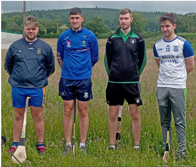
Wicklow's Senior Poc Fada players

The 2023 edition of Wicklow's Poc Fada took place on Sunday 11th June in the COE Ballinakill, and it resulted in the largest number of players competing at both Senior and U16 levels. All in all 26 players took part on the day with 13 each for Hurling and Camogie. This was one of many firsts for Wicklow Poc Fada in 2024. Among others were the first Sister act to represent Wicklow at the provincial level. Also a first in this years competition was the awarding of County titles and medals in the hurling events.