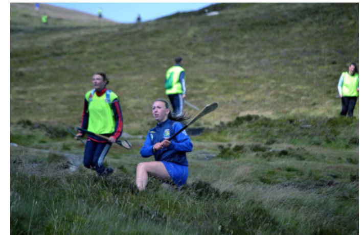
Camogie action from the Leinster Poc Fada final