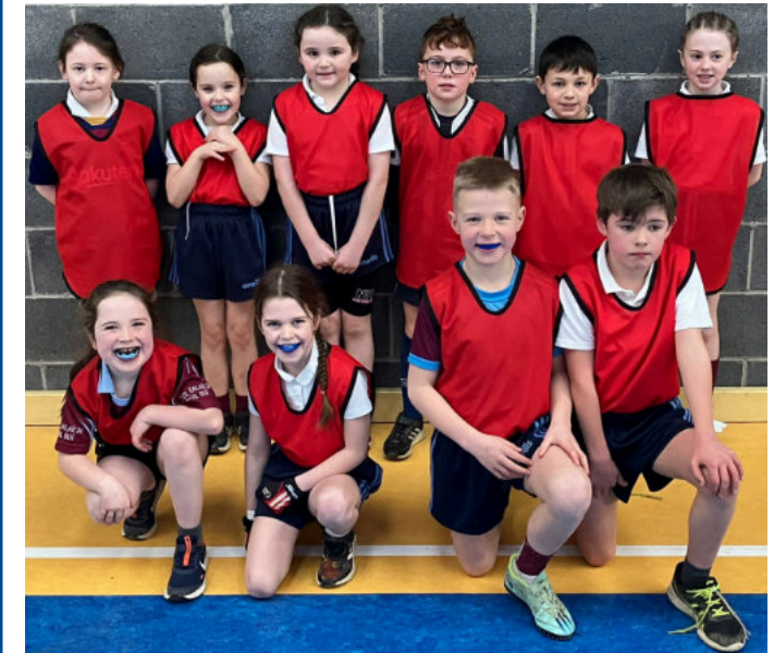
St Mary's Coolfancy

There was a fantastic attendance in Bray Emmets for the 5th and 6th class boys hurling participation blitz on Thursday, 12th of October. Fifteen teams from ten different schools put on an exhibition of hurling for those who were lucky enough to attend. The massive potential for hurling in the Greystones area was highlighted by the fact that six different teams lined out from the area; two from Greystones C.N.S, two from Greystones Educate Together and one each from Gaelscoil na gCloch Liath and St. Laurence's. It is no wonder either, how Bray Emmets are becoming a hurling powerhouse with the work that is being done in the local primary schools. Two excellent teams St. Cronan's took part, along with a very talented team from Scoil Chualann. St. Fergal's of Bray have