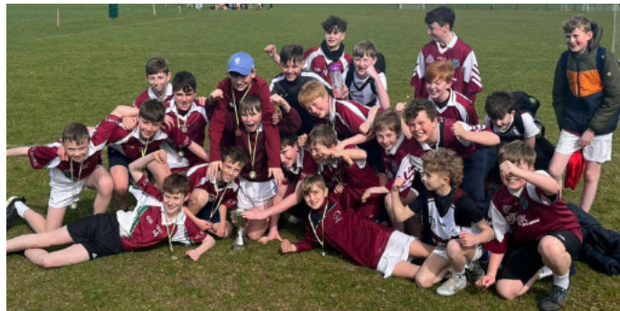
St Kevin's Div 1 Coughlan Cup Winners

September 28th was a great day for members of 5th and 6th Class girls from Scoil Chaoimhin Naofa, Laragh. We played four matches against Ballycoog/Annacurra, Aughrim 2, Annacurra and Aughrim 1. Everyone had such an exciting day and all teams played excellently. What really made the day so enjoyable was the incredible teamwork and great sportsmanship that our team and other teams showed. What also made our day even better was the encouragement from other teams and teachers supporting each other. The bus ride