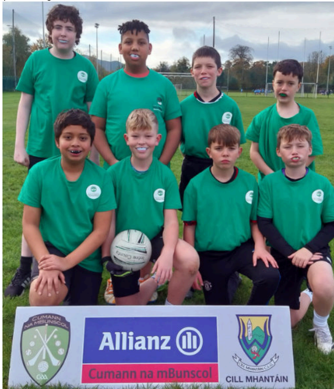
Greystones Educate Together

An Allianz Cumann na mBunscol football blitz for 5th and 6th class boys was held in Blessington GAA club on May 4th. These blitzes are open to all primary schools in West Wicklow. Schools