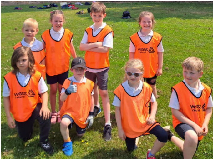
Gaelscoil na Lochanna

Kilcoole PS, Scoil na Coroine Mhuire Ashford, St Laurence's, St Brigid's, St Peter's, St Fergal's, Greystones ETNS, Greystones CNS, Gaelscoil Na gCloch Liath, Gaelscoil Chill Mhantáin, Roundwood NS, Holy Rosary Wicklow Town and Ravenswell. The teams were split into 6 divisions for the competition with the top team in each division crowned winners. Over the three games played by each team, there was a wonderful exhibition of football skills. Well done to all schools and children who participated. See winners and runners up from each division is below.