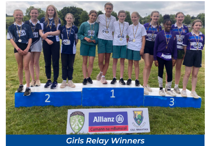
Girls Relay Winners