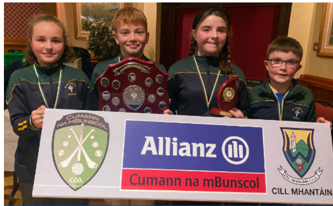
St Pat's 1 st Place

Most importantly, we want to say thank you and well done to the children who participate in such a sporting manner in our activities. The primary school games, for many is their first exposure to Gaelic games and we hope it is a positive one. We look forward to another year of progression and hard work where our efforts are concentrated on making Gaelic games the games of choice of our pupils. Our aim is that every child in our schools is given the opportunity to participate so that they develop a love of our national sports and culture in an atmosphere of sportsmanship, safety but most of all fun. Looking forward to 2024 already!