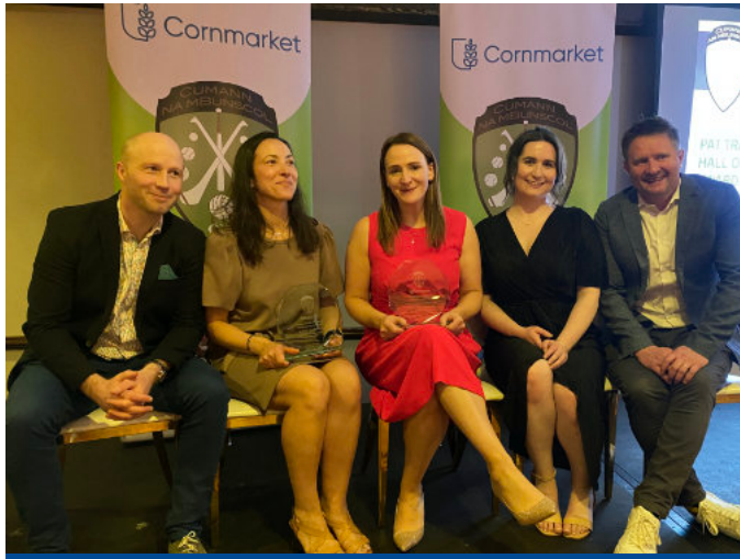
National Awards 2023