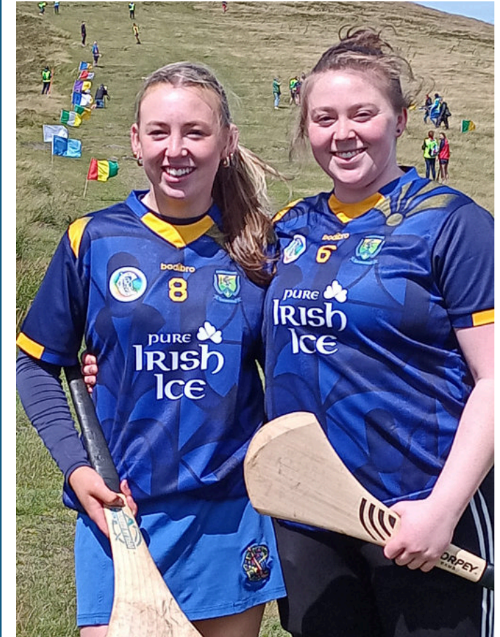
"Sisters are doing it for themselves". Wicklow's 2023 Camogie Fada Champions, the Byrne sisters of Annacurra Camogie Club who both played in their own and acted as each others Gasóg in the Leinster Camogie Poc Fada finals on Mount Leinster.