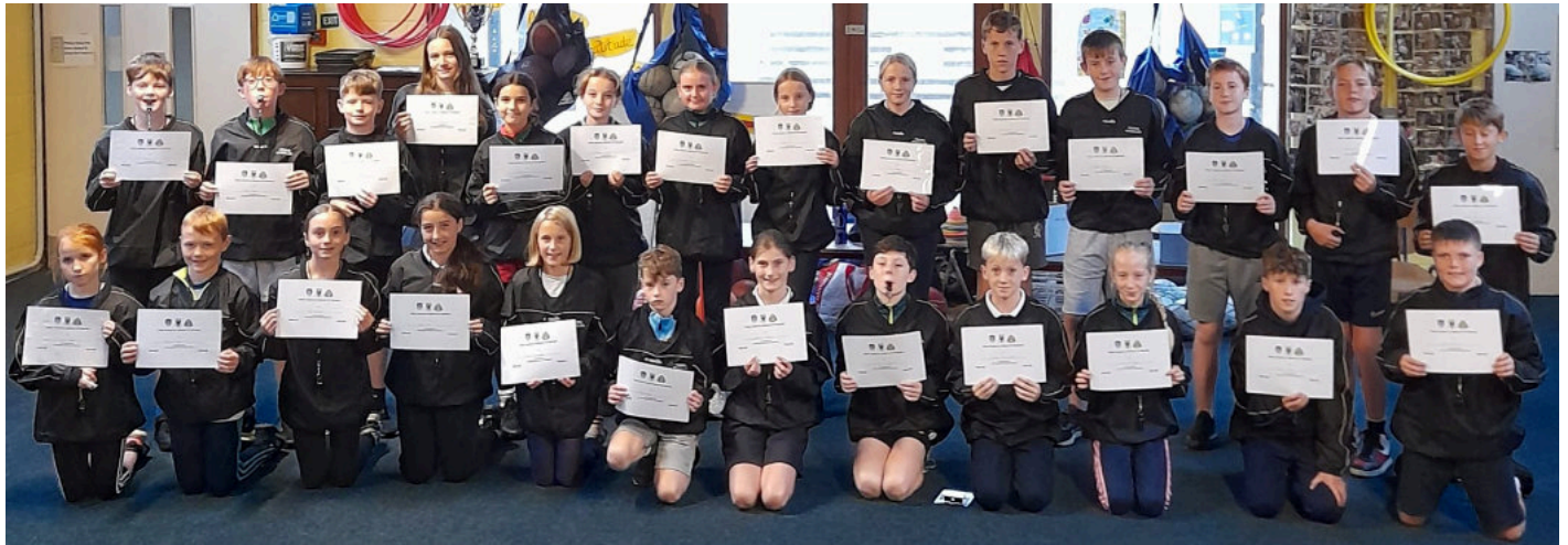
Young Whistlers Group