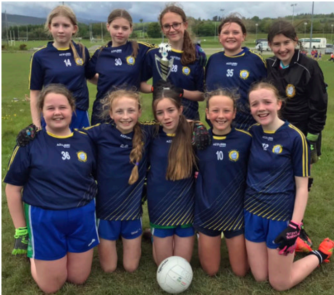
Gaelscoil an Inbhir Mhóir