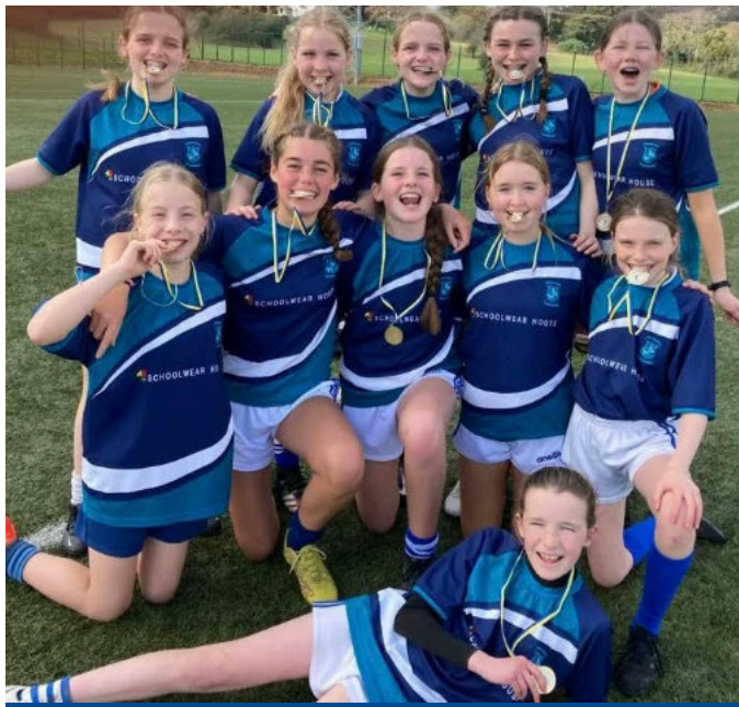
St Laurence's Div 1

back to school was a lot quieter than the ride there, as all of us were about to fall asleep in our seats but we were still chatting away about the fun time that we had. Over all it was a fantastic day and we are all looking forward to the next blitz even if it is a while to come yet.