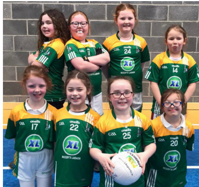
Scoil Chaoimhín Naofa

Cumann na mBunscol began the school year as it had finished up, with a full calendar planned; and