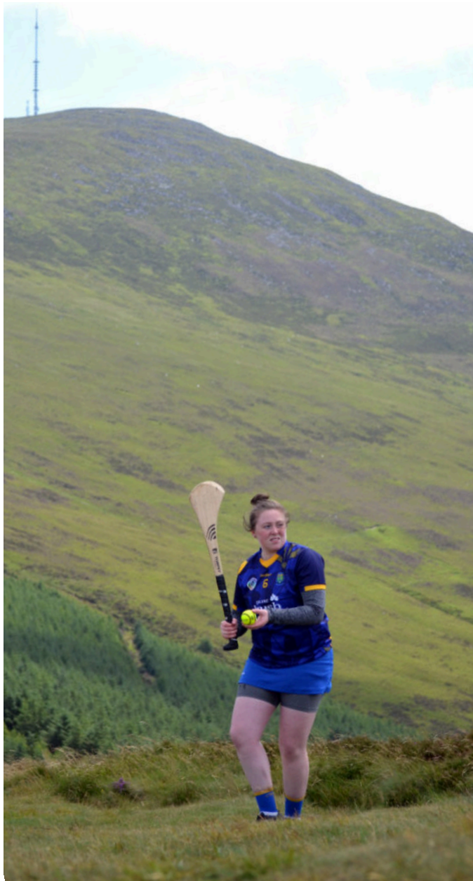
Senior Camogie action from the Leinster Poc Fada final

While Poc Fada is seen as an individual event the Leinster Poc Fada Finals held on Mount Leinster highlighted how it's actually a team sport for the player. In Poc Fada each player