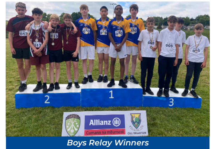
Boys Relay Winners