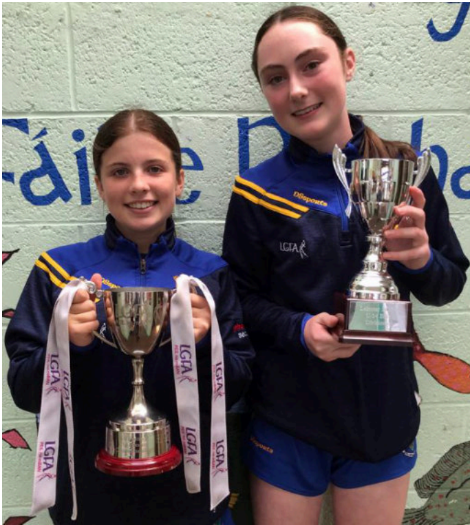
U14 Ladies in KPS