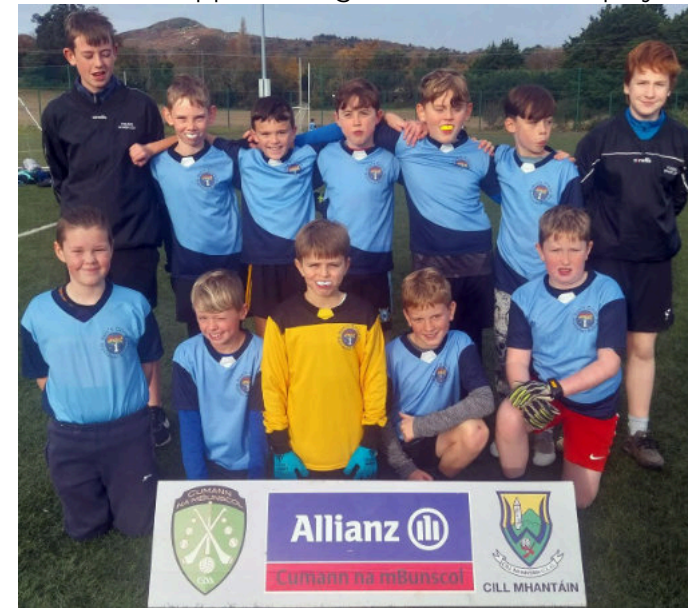
Nuns Cross and Young Whistlers

Before schools finished up for the holidays in June many Wicklow players visited various schools around the county with All-Ireland trophies, many of whom are past pupils and have graced the fields at Cumann na mBunscol competitions. The Senior hurlers brought the Nicky Rackard cup, the Under-17 hurlers brought the Celtic Challenge trophy and the Under-14 ladies footballers brought the Bronze Football cup. It was heartening to see excitement ripple through schools as these players