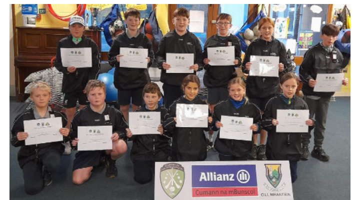
Hurling Young Whistlers