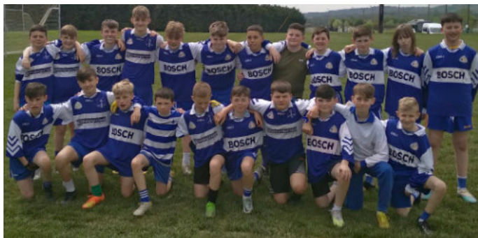
St Mary's SNS Blessington