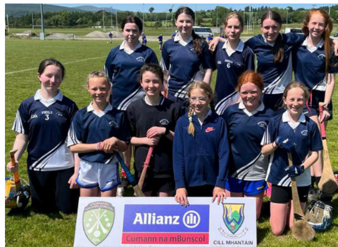
Gaelscoil na gCloch Liath

Day 2 of the Girls' Football Wicklow Times Shield was held in Bray Emmets on Thursday 30th March. This was the final competition of the girls' football schedule this year. There were 24 teams participating from the following schools: Kilmacanogue NS, Newtownmountkennedy PS,