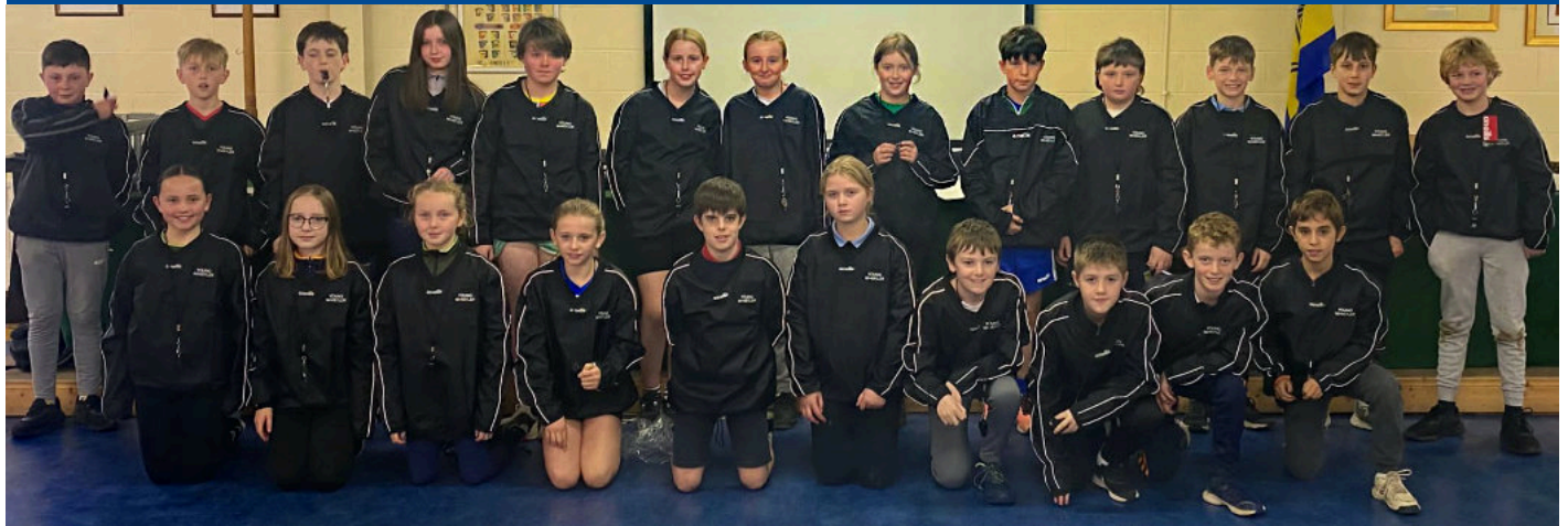
Young Whistlers South