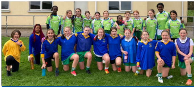
West Wicklow Girls

opportunity with a fine array of skills and team work on display. The turnout on the day was very positive with 27 teams representing 12 different schools. A special word of thanks and praise for the many Young Whistlers who assisted with refereeing at the blitz. All the Young Whistlers went about their task in a very fair, friendly and assured manner. Schools represented: Kilmacanogue NS (2), Newtown (2), Ashford (3), St. Laurence's (5), St. Cronan's (2), Nuns Cross (2), Greystones Community National School (2), Greystones Educate Together (3), St. Brigid's, St. Peter's, Holy Rosary (2), Gaelscoil na gCloch Liath (2).