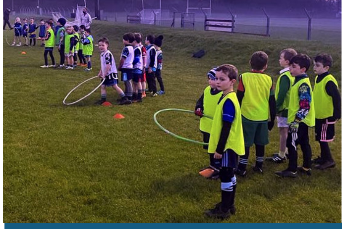
Under 7's in training

against the u10 An Tóchar girls. Throughout the season we participated in 9 blitzes with Bray Emmets home and away, Greystones home and away, St. Pat's home and away, Laragh, Arklow and a monster blitz in Ballinakill. We finished off the season with a friendly match against the U10 An Tóchar girls again. It was clear to see each child's level of skill improving as the season progressed and this team has a bright footballing future ahead of them.