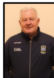
AR rheim De go raibh a n-anamcha.