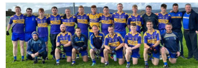
Junior C Footballers

Our Junior Footballers gained promotion to Division 3 this year which was a big step for our young team. We had a few heavy defeats in this league. We were graded to Junior C Football Championship after our dire display in the league. We reached the Junior C Football Championship Final but we met a very experienced Blessington team. We felt that with a month off from Semi Final to the Final, impacted our potential in the Final. We hope to have a great run in the Championship next year.