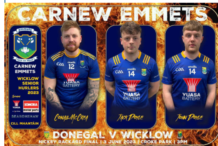
Our County Nickey Rackard Players