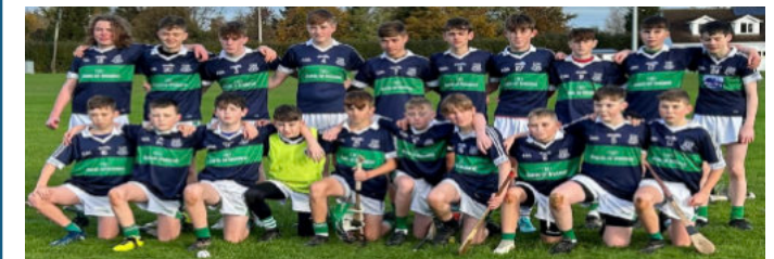
Under 13 Hurlers

The day was marked by strong teamwork, respect and camaraderie between the teams.