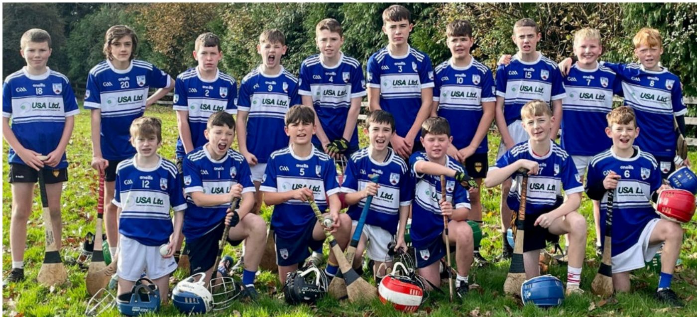
Under 13 Hurling