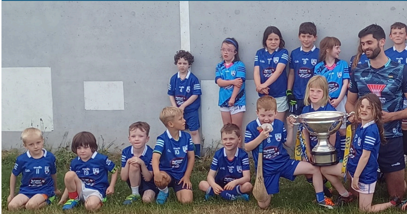
U9's & U7's footballers and hurlers