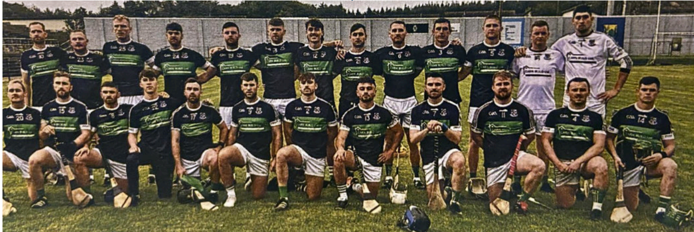
Senior Hurlers five-in-a-row Wicklow Senior Hurling Champions

Senior hurlers march to historic Wicklow five-in-a-row