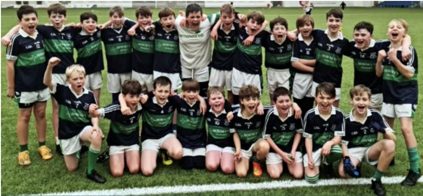
U-12 Footballers into the Dome and into the West!