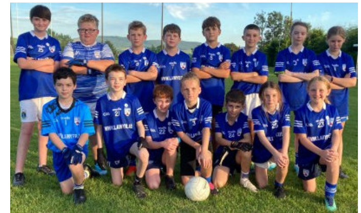
Under 11 Football