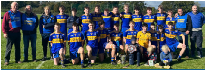
Minor Hurling Champions