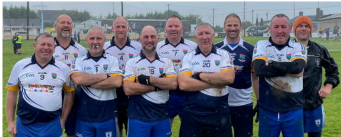
Joe Mc'Nally 7's