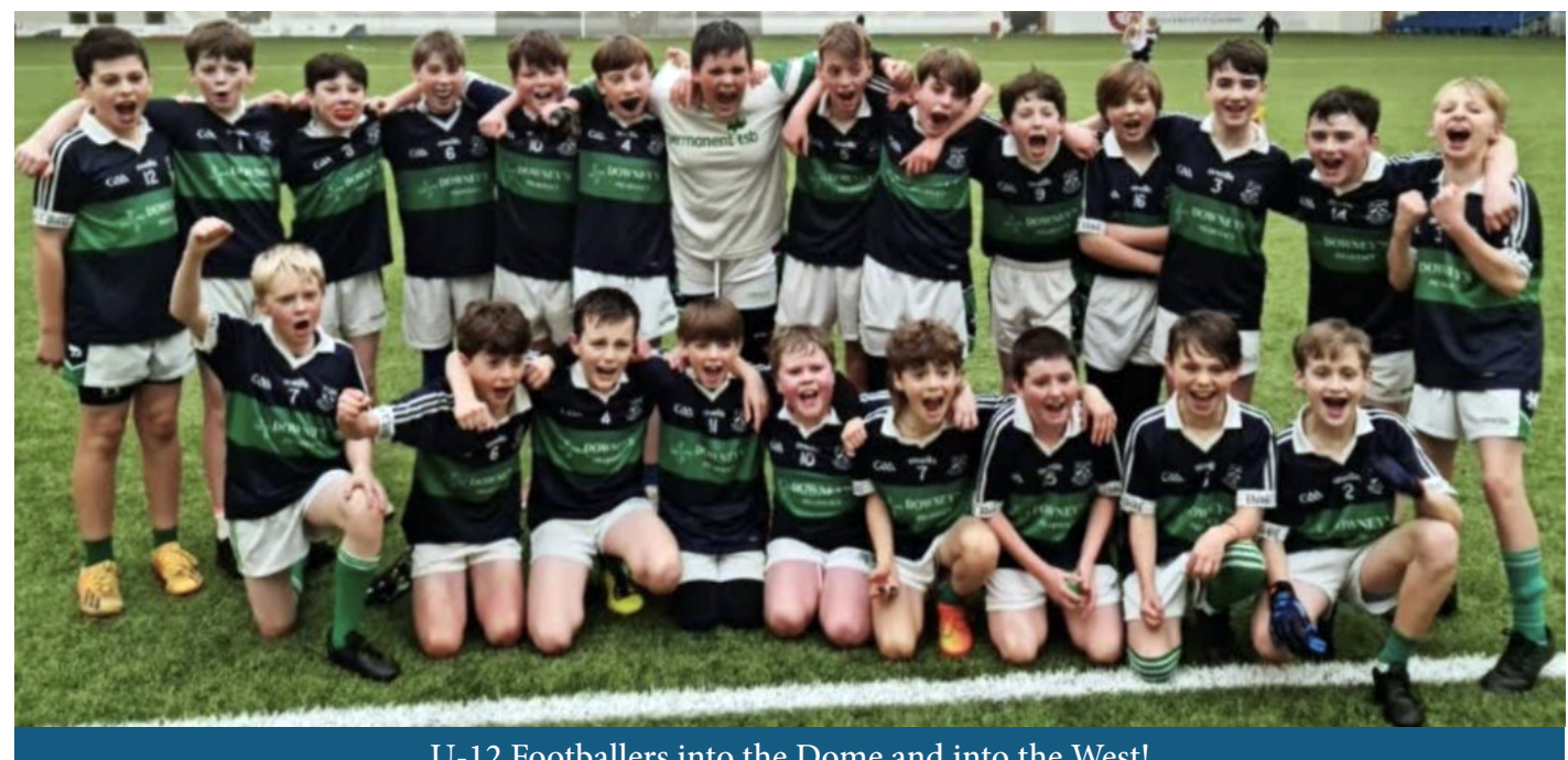
U-12 Footballers into the Dome and into the West!