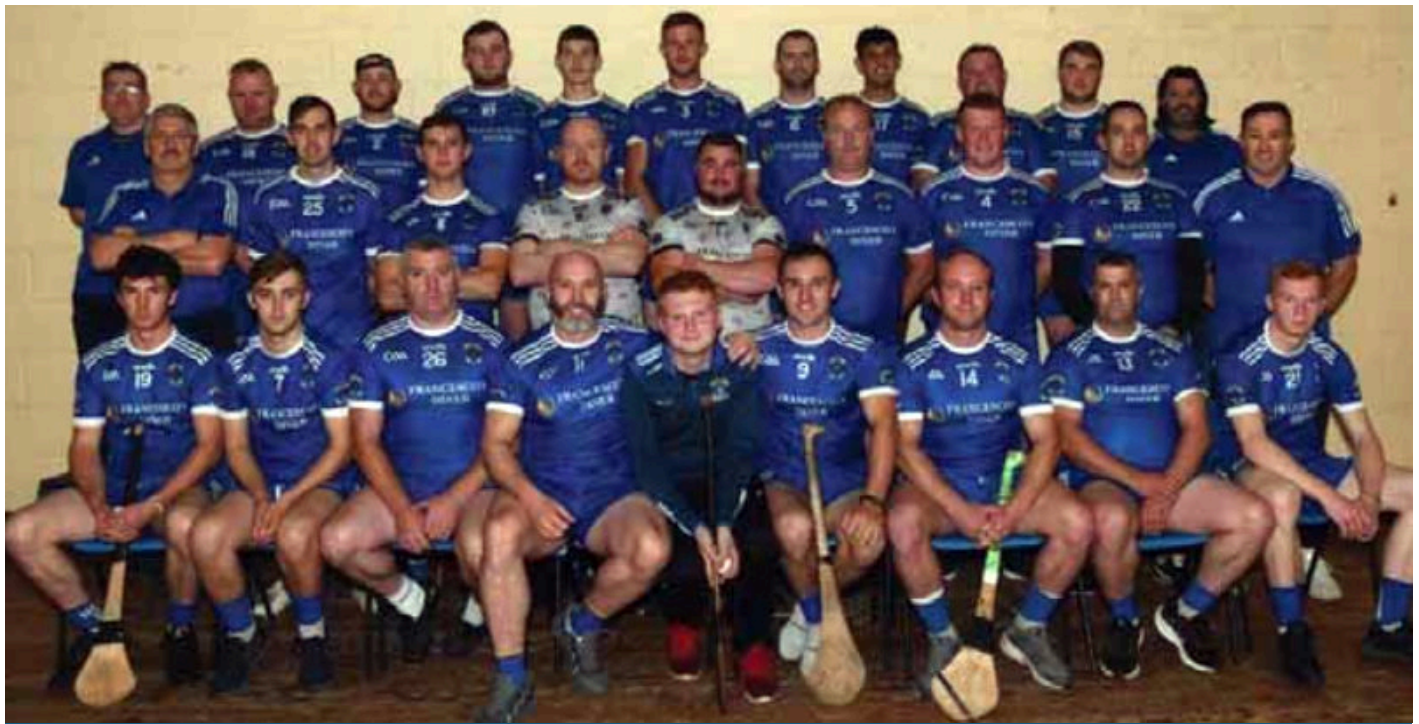
Intermediate Hurling Champions 2023

Throughout the year the players committed to training both on the field and in the gym. Fitness levels increased and this showed in the results. We asked the question and the players responded. Competition for places grew and winning games became more of a habit than a rare occasion. We participated in many challenge matches against teams from Dublin Wexford and Kilkenny allowing us to improve even further.