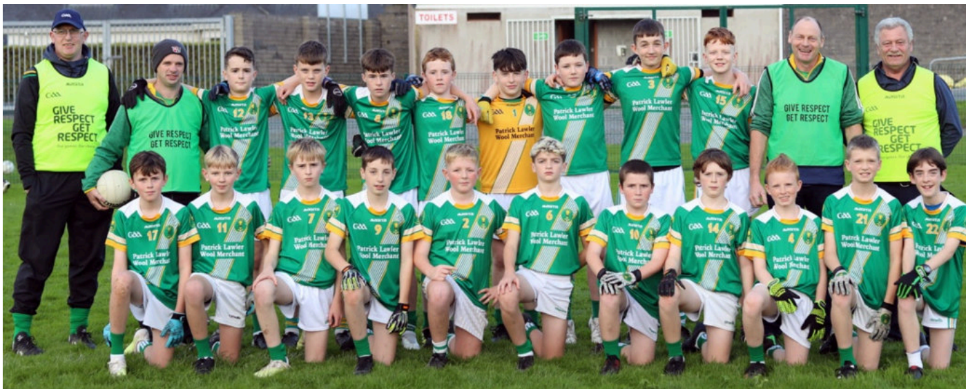
U13 Shield Final