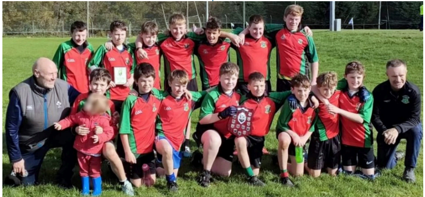
Under 13 E Shield Winners