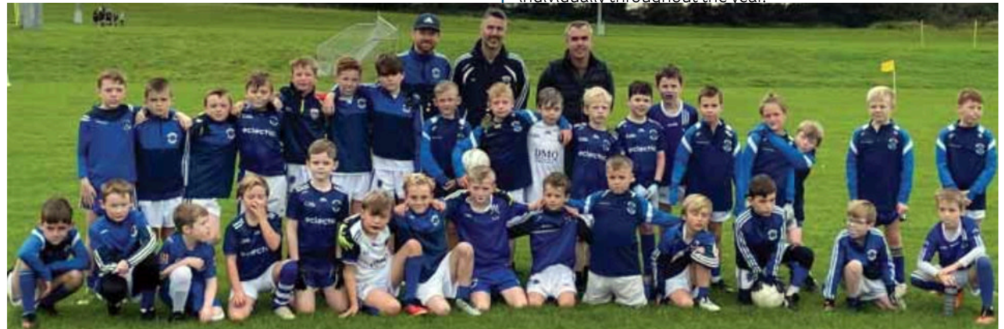
Under 9 Football

The U11 lads enjoyed a mixed season but none the less they worked their socks off all year improving on their game understanding and skills. During the year the lad's skillset improved and their understanding of the game also improved session by session. There are some excellent individual players