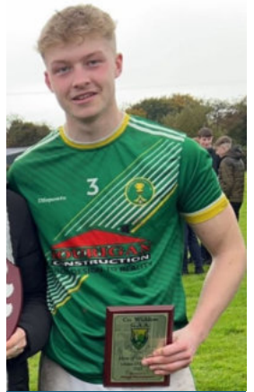
Minor A Player of the Match