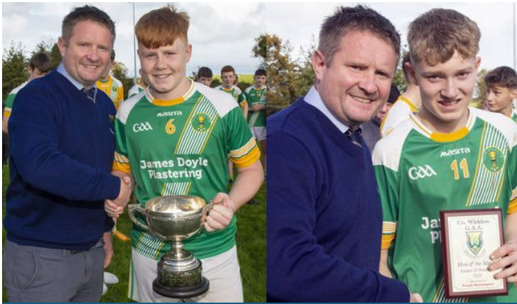
U15A Championship Captain and Player of the Match