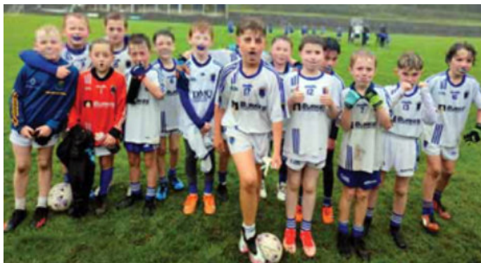
Under 11 Football

The league was played on a home and away basis, this involved trips to west Wicklow on occasion to places like Baltinglass, Blessington, Donard and then closer to home on the east side