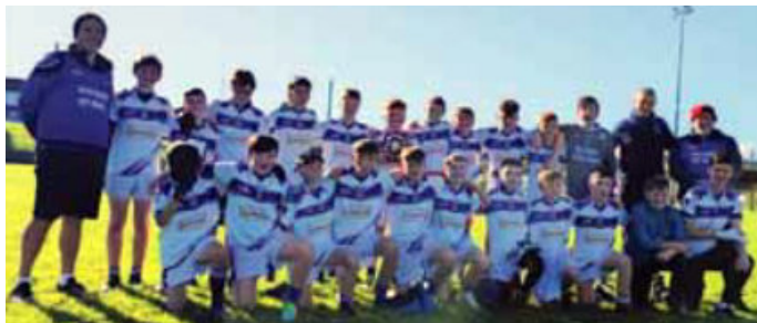
Under 13 Football