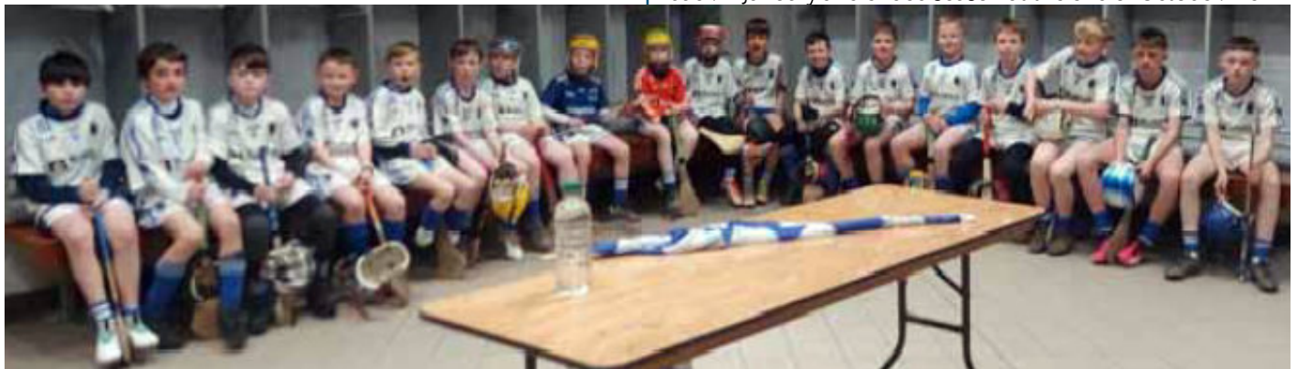
Under 11 Hurling

The under 15 boys had a very good season. They commenced back in January and ended season at the end of October. We