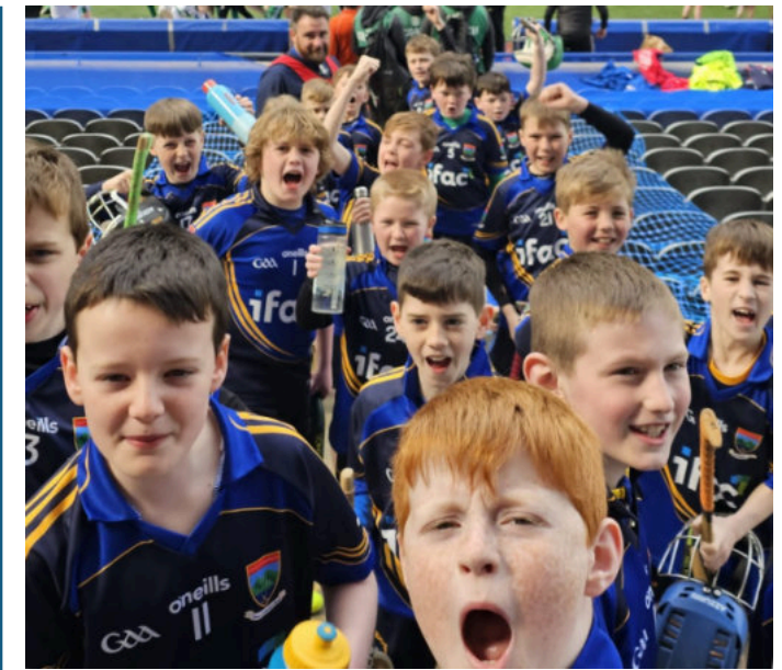
Under 11's in Croke Park