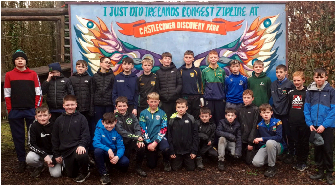
U12's and U13's team banding in Castlecomer park