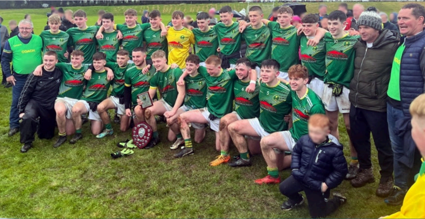
Minor A Champions