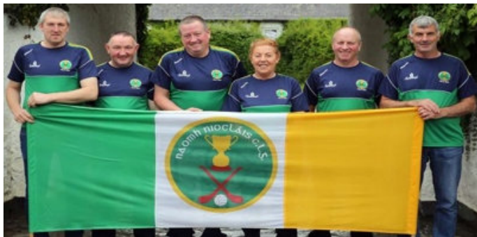
U15 Feile Coaches