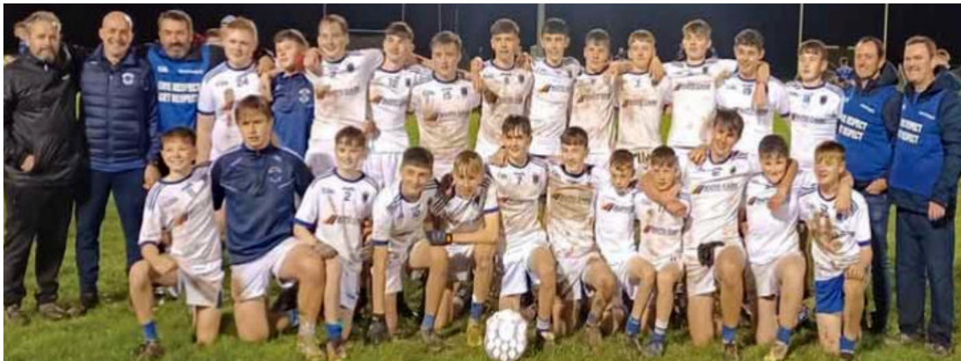
Under 15 Football