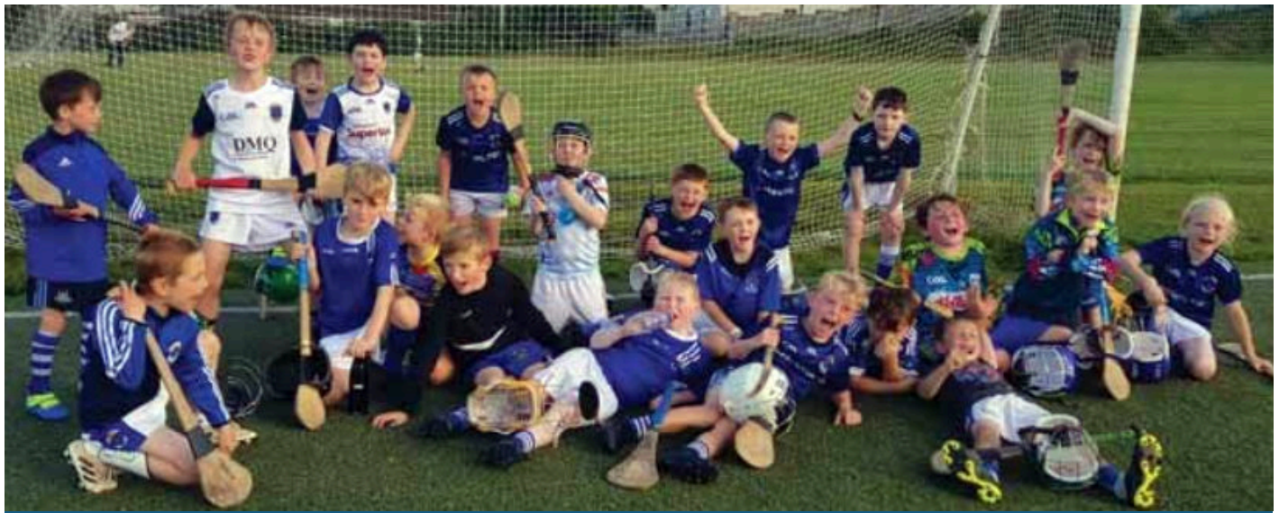
Under 9 Hurling

against Bray Emmets, Enniskerry, Greystones, Kilcoole, Rathnew, Barndarrig and Arklow.