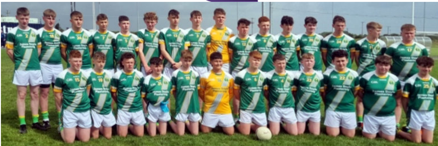
U15 Wicklow Feile