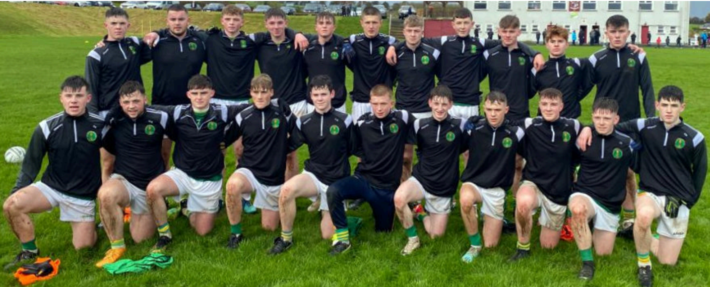
Minor A Champions