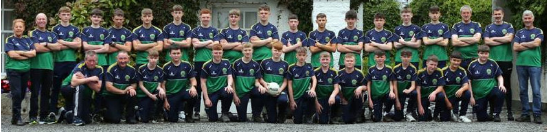
U15 Feile Team