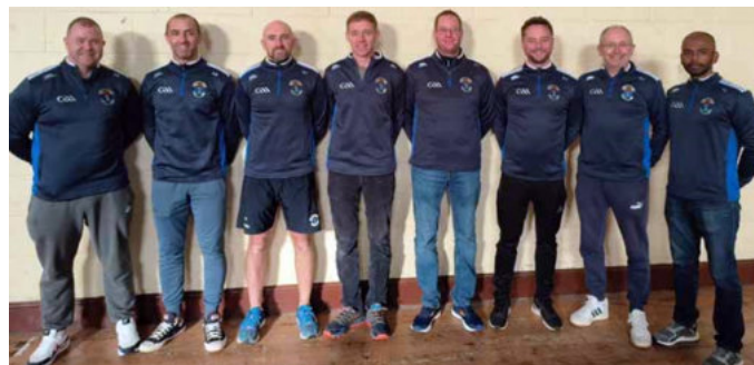
Under 7 Coaches