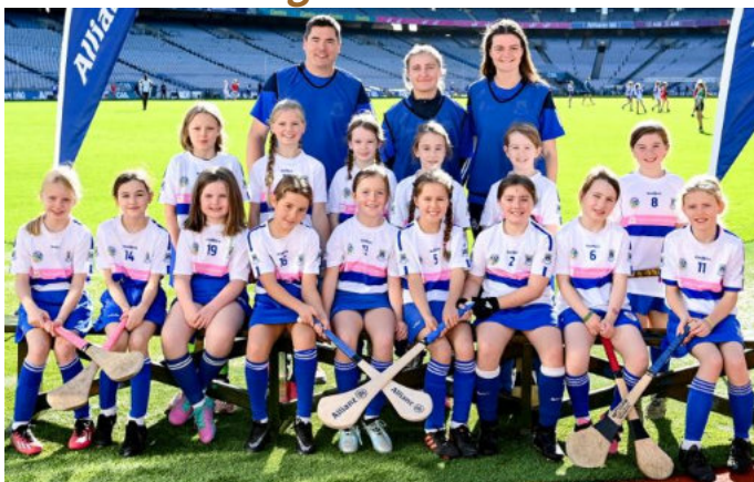
Under 9's in Croke Park