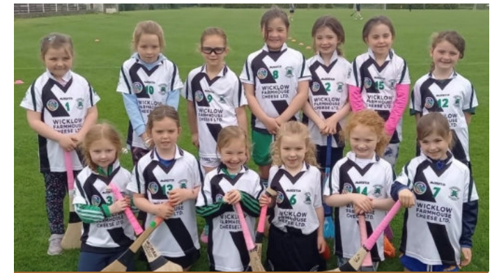
Under 6's / 8's

THIS YEAR WAS AN AMAZING YEAR FOR U6/U8 CAMOGIE TEAM. WE HAD A GREAT LITTLE TEAM OF ABOUT 20 GIRLS THAT GAVE IT THEIR ALL THROUGHOUT THE YEAR. THESE GIRLS WERE A JOY TO COACH AND HAD GREAT ENTHUSIASM AND LOVE FOR THE SPORT. IT WAS GREAT TO SEE THEIR CONFIDENCE GROW EVERY WEEK AND TO SEE ALL THE GREAT