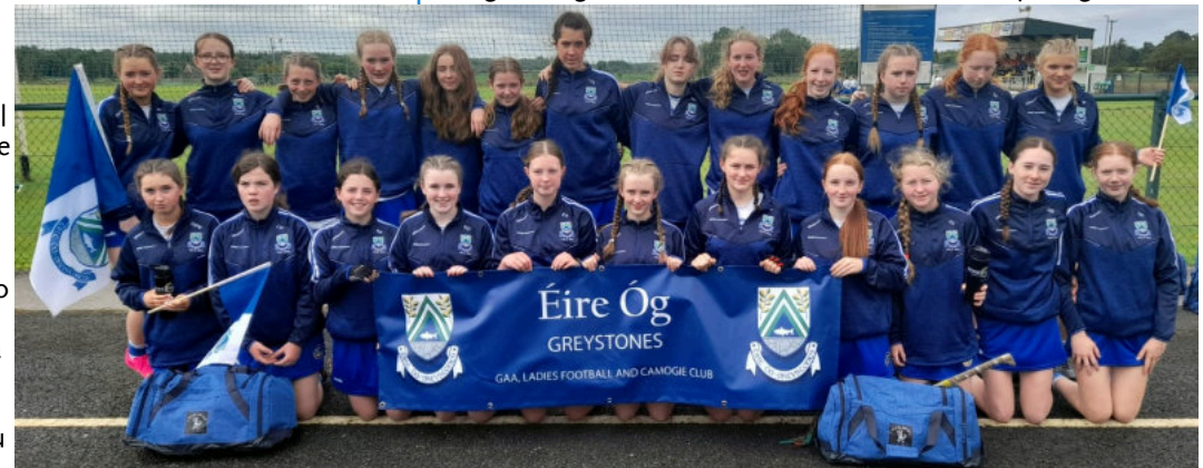
Under 15 Feile

To our committee members who do countless hours of unseen work to keep our club up and running and in organising fantastic events. Our referees and young