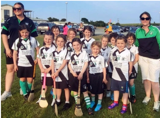
Under 6's / 8's