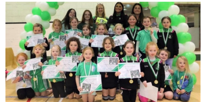
Under 6's / 8's

THE U10 CAMOGIE TEAM HAD A HIGHLY SUCCESSFUL YEAR. THE GIRLS TRAINED 2 NIGHTS A WEEK AND TOOK PART IN