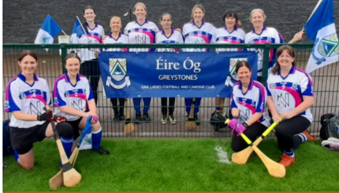
Camán and Chat

Finally thank you to our nearly 300 Camogie players from U8s to Camán and Chats who represent the club with pride both on and off the field. Your participation and enthusiasm embodies the core values of our camogie club; Fun, Inclusivity, Respect and Effort.