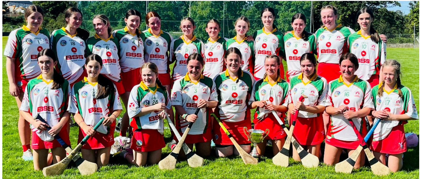
Under 16's Wicklow Camogie Under 14 B Winners

OUR U16 TEAM HAD A TOUGH START TO THE YEAR IN THE LEAGUE. WE STRUGGLED WITH NUMBERS DUE TO GIRLS AWAY IN SCHOOL AND OTHER COMMITMENTS AND RELIED ON OUR U14S TO HELP US FIELD A TEAM. WE WEREN'T SUCCESSFUL IN THE LEAGUE. AS A RESULT OF OUR LEAGUE CAMPAIGN, WE WERE PLACED IN THE "B" CHAMPIONSHIP FOR THE