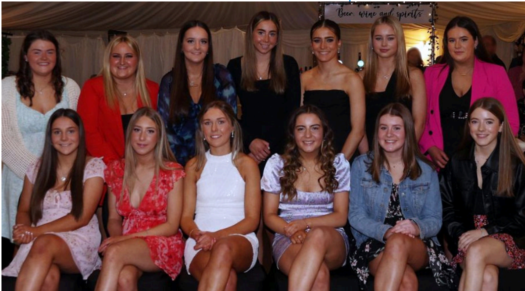
Our Seniors at the 2022 Awards Night

WE ALSO WANT TO THANK OUR PLAYERS AND PARENTS - THE PLAYERS FOR THEIR COMMITMENT TO THEIR