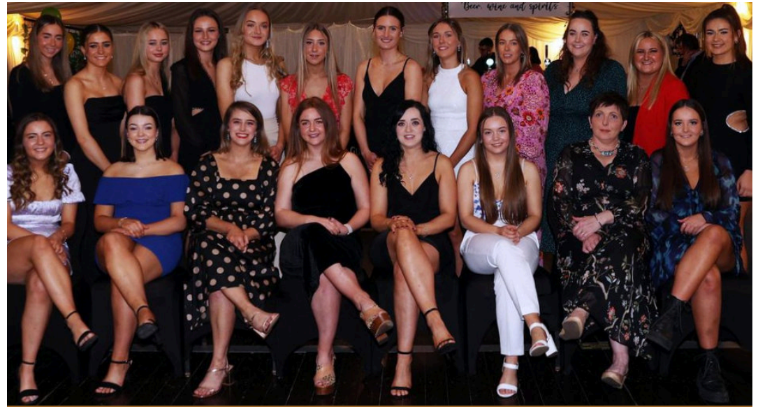
Our Seniors at the 2022 Awards Night

THE JOINT COMMITTEE ARE STILL WORKING HARD TOGETHER BUT WOULD LOVE NEW FACES TO GET INVOLVED TO CONTINUE TO PUSH THESE IMPROVEMENTS. CONTINUED SUPPORT FOR FUNDRAISING WOULD ALSO BE WELCOME.