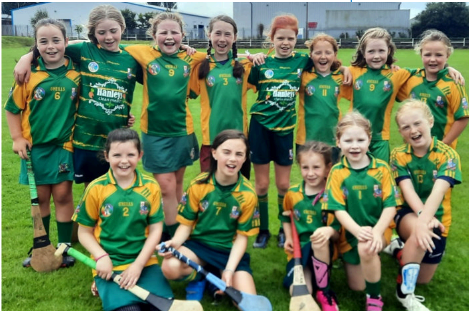
Under 8's and 10's

CHAMPIONSHIP KICKED OFF ON JULY 10TH AT HOME TO AUGHRIM BUT UNFORTUNATELY, WE WERE TIGHT ON NUMBERS ON THE EVENING WITH GIRLS INJURED AND ON HOLIDAYS RESULTING IN DEFEAT. THE CHAMPIONSHIP DIDN'T GO TO PLAN OVERALL WITH TRAINING AND FIXTURES DISRUPTED HOWEVER WITH A SEMI FINAL VICTORY OVER AUGHRIM THE GIRLS SET UP THE ULTIMATE LOCAL DERBY AGAINST KILTEGAN. EVERYTHING WENT TO SCRIPT IN THE