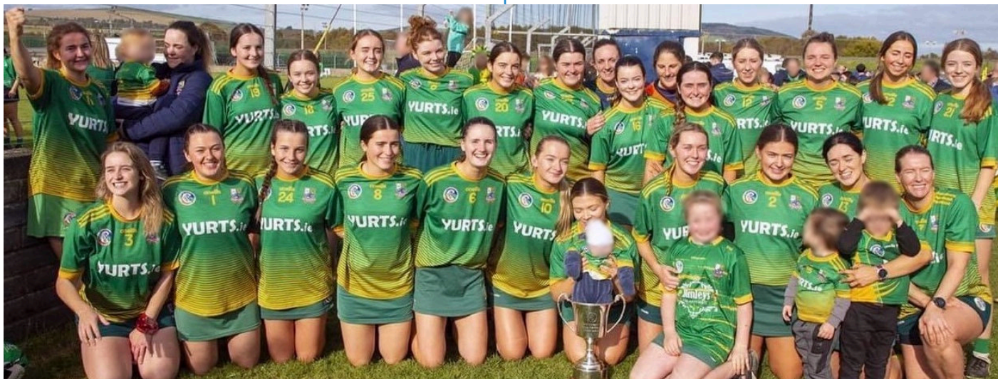
Wicklow Camogie Senior County Champions

ON THE 15 APRIL, WE HELD OUR 2023 ADULT PRESENTATION NIGHT IN O CONNORS MARQUE, TINAHELY. WE HAD MEDAL PRESENTATIONS FOR OUR MINOR AND SENIOR WINNING TEAMS. IN ADDITION TO FAMILY MEMBERS, WE WERE ALSO