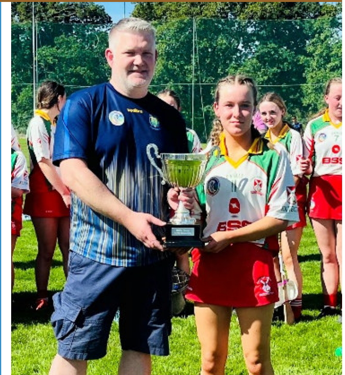
Under 16 B Trophy presentation

WITH THE EXAM BREAK THE COUNTY BOARD RAN A SUMMER SIZZLER 7 ASIDE COMPETITION, WHICH WAS A GREAT WAY FOR OUR PLAYERS TO KEEP PLAYING CAMOGIE WHILE THE GIRLS WERE DOING EXAMS. WE FELT THIS WAS A GREAT COMPETITION.