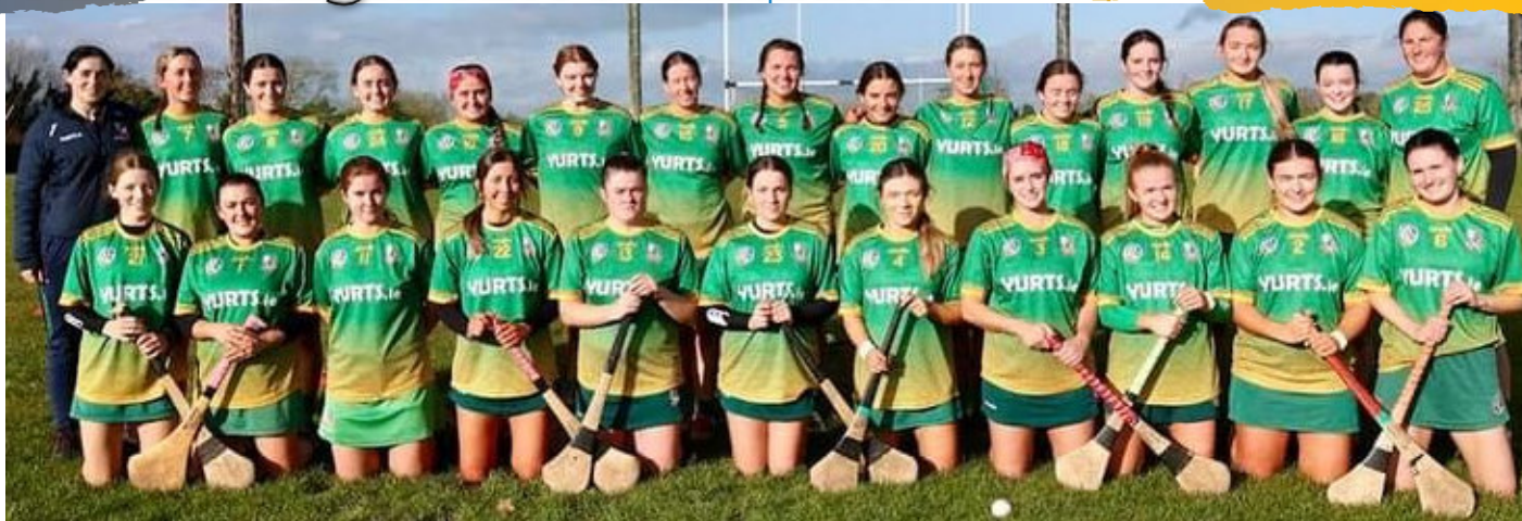
Leinster Camogie Junior A Provincial Champions

JANUARY 2023 FINISHED WITH A BANG. AN IDEA WAS SPRUNG DURING THE CELEBRATIONS AFTER THE LEINSTER FINAL TO RUN A TRACTOR RUN AS A CLUB FUNDRAISER. A TAGLINE WAS EVEN AGREED UPON BEFORE THE NIGHT WAS OVER- 'LIGHT UP FOR THE KNOCKANANNA CAMOGIE LADIES'. THE EVENT WAS HELD ON 29 JANUARY AND TURNED OUT TO BE A RESOUNDING SUCCESS, AND A THOROUGHLY ENJOYABLE DAY