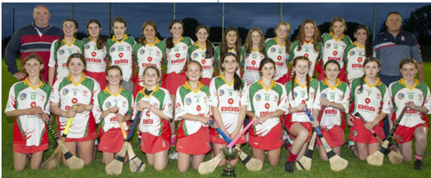
Under 14's Wicklow Camogie Under 14 B Winners

WE HAD A POOR START TO THE YEAR WHEN IT CAME TO THE LEAGUE. AFTER THAT WE WERE OUT IN THE CHAMPIONSHIP