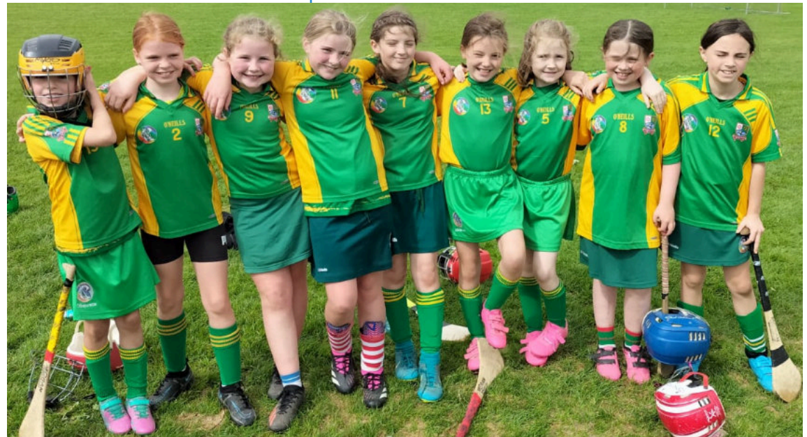
Under 8's and 10's