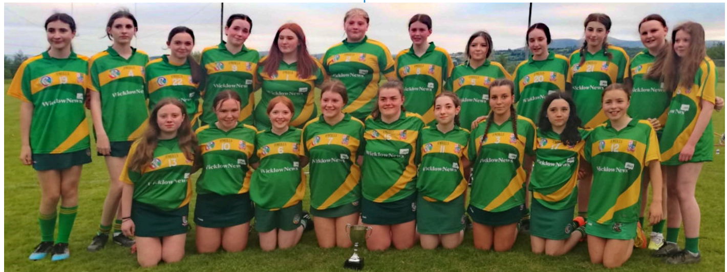
Wicklow Camogie Under 16 League Winners