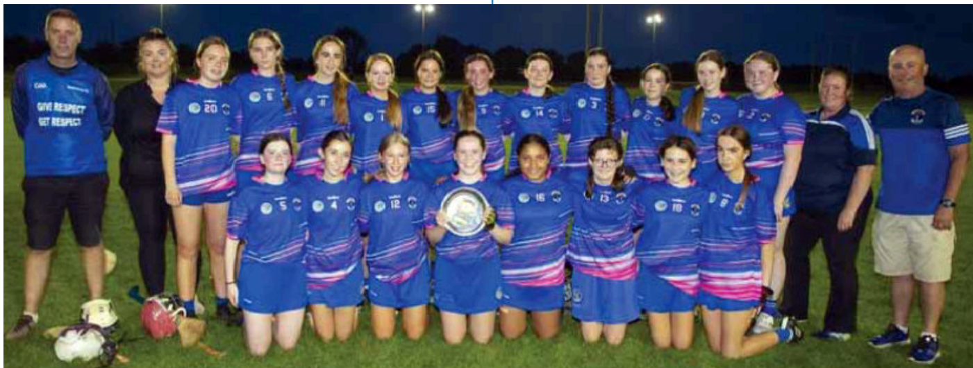
UNDER 16 C SHIELD WINNERS

ST. PAT'S CAMOGIE WAS ALSO REPRESENTED AT COUNTY LEVEL WITH 4 OF THE U16 PANEL PLAYING WITH THE COUNTY DEVELOPMENT TEAM, WHERE THEY GOT GREAT EXPERIENCE TRAINING WITH GIRLS FROM OTHER CLUBS AS WELL AS PLAYING INTER COUNTY MATCHES.