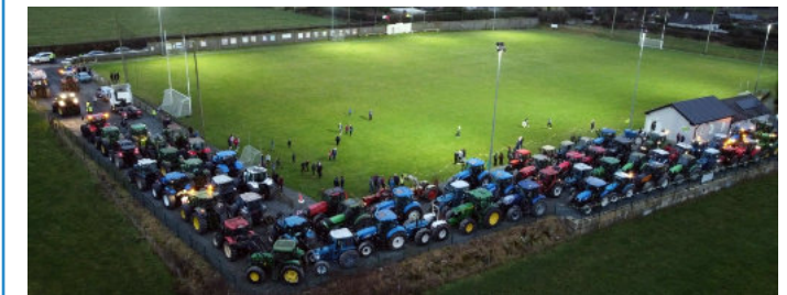
Camogie Tractor Run